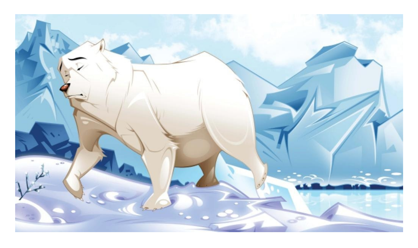
I'm leaving. I'll go and find a colorful place.