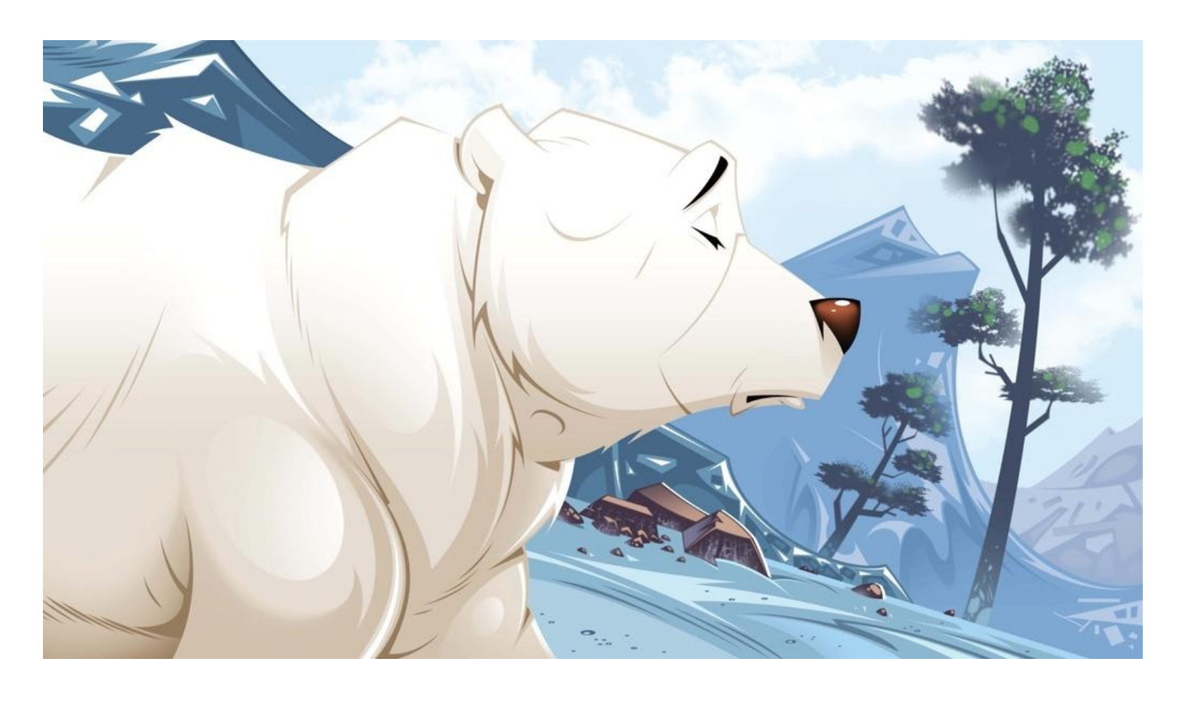
I'll leave this place and go back to where I came from, where it's all white.