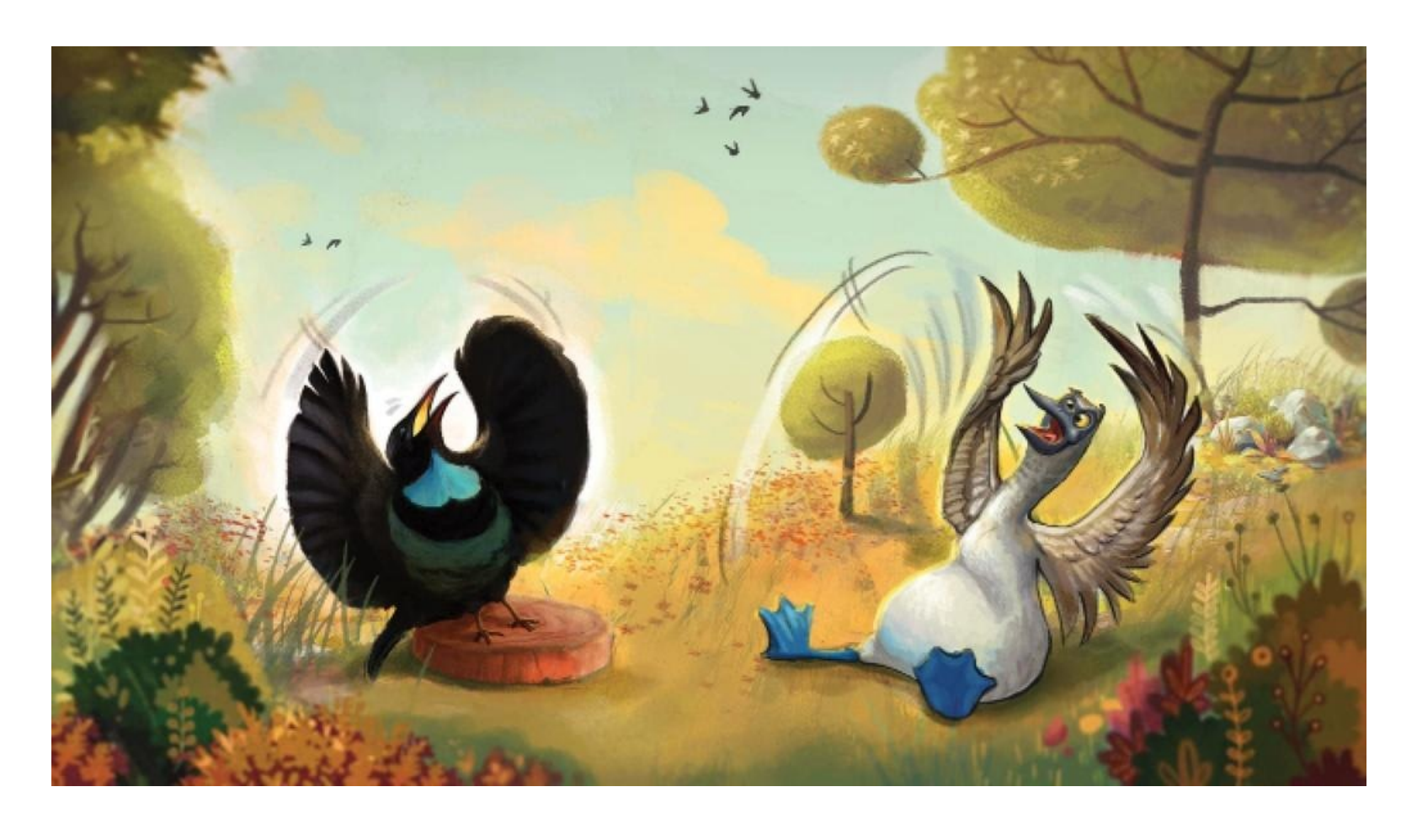
Zakadam saw the bird of paradise. He called with wonder: "How beautiful you are!" But the bird of

paradise didn't reply. It was too busy dancing. Zakadam tried to do the same, but he can't dance.