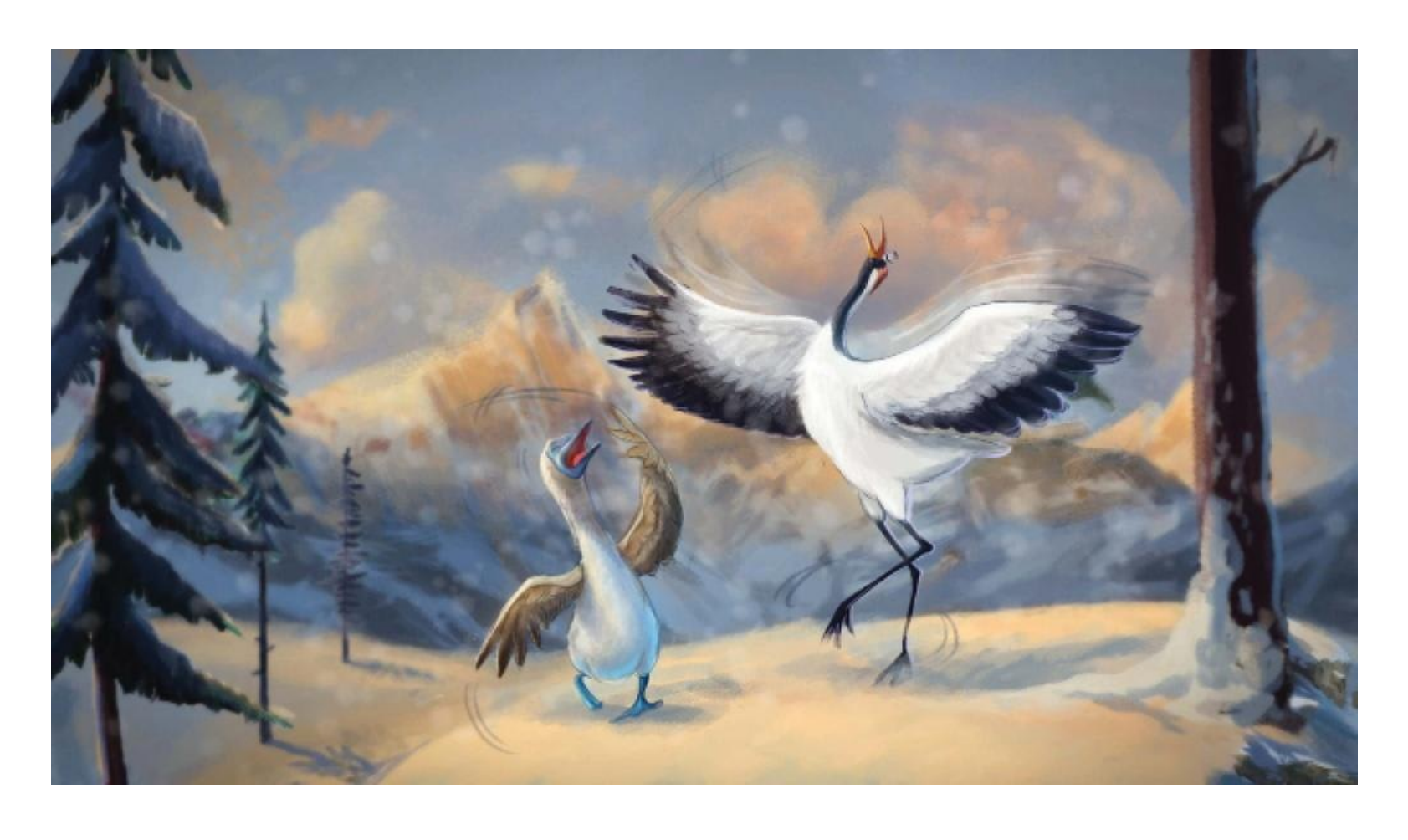
Later on, a female blue footed booby passed by Zakadam. Zakadam tried to dance, and this time....