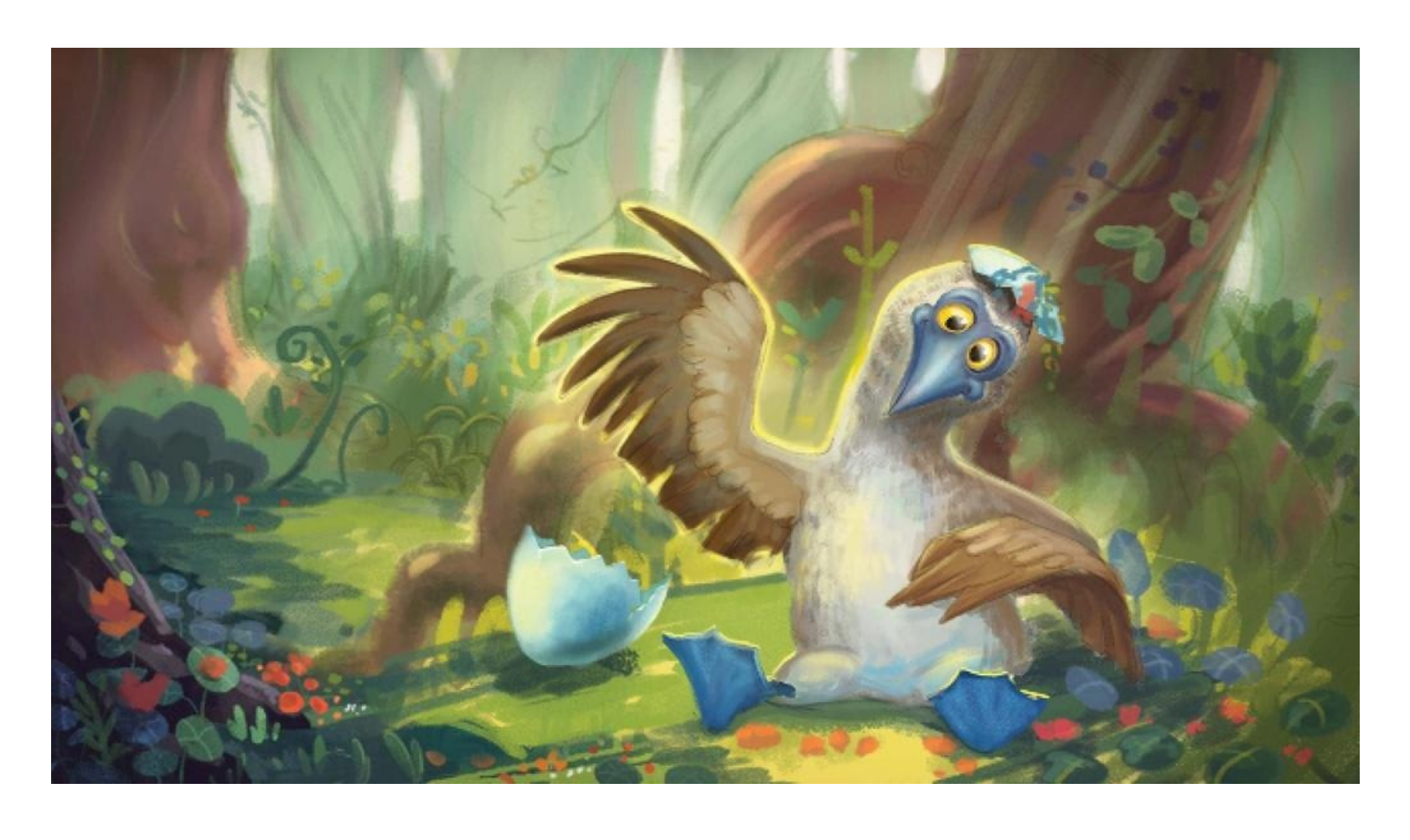
An egg hatched, and a baby blue footed booby came out. Mama and Papa blue footed boobies named him Zakadam.