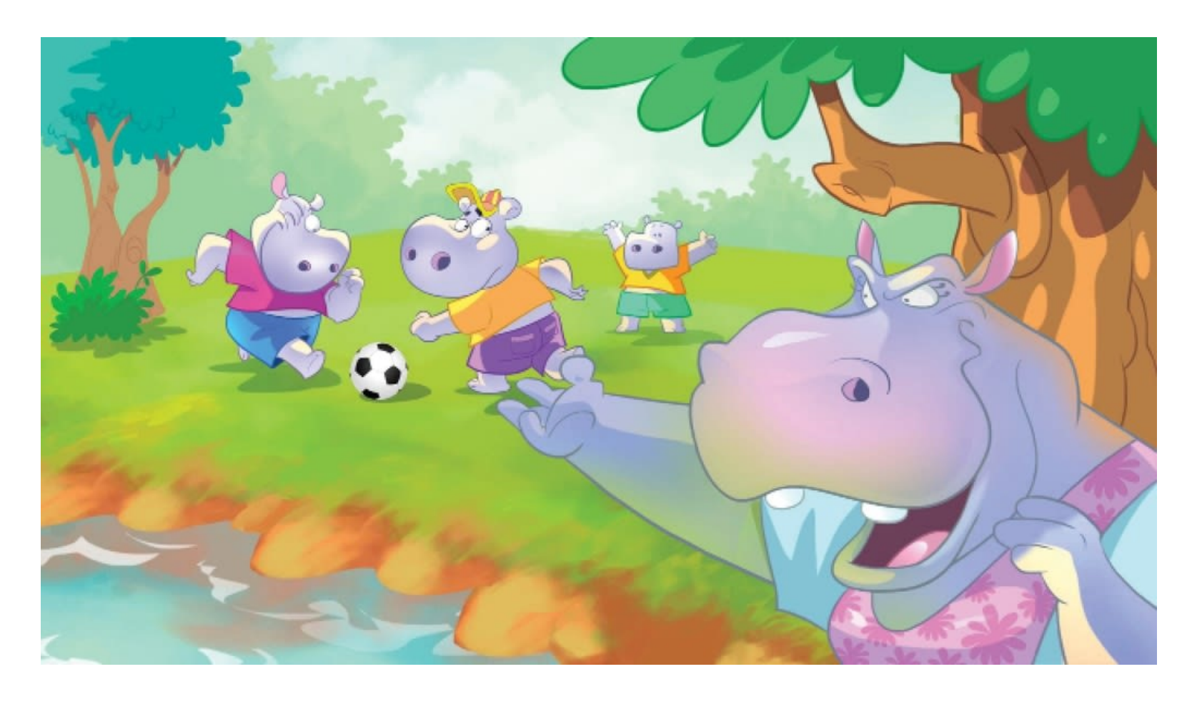
Billy's mother became upset, Billy's mother became mad. Then, she suddenly yelled, "Can't you make yourself useful, young lad?"