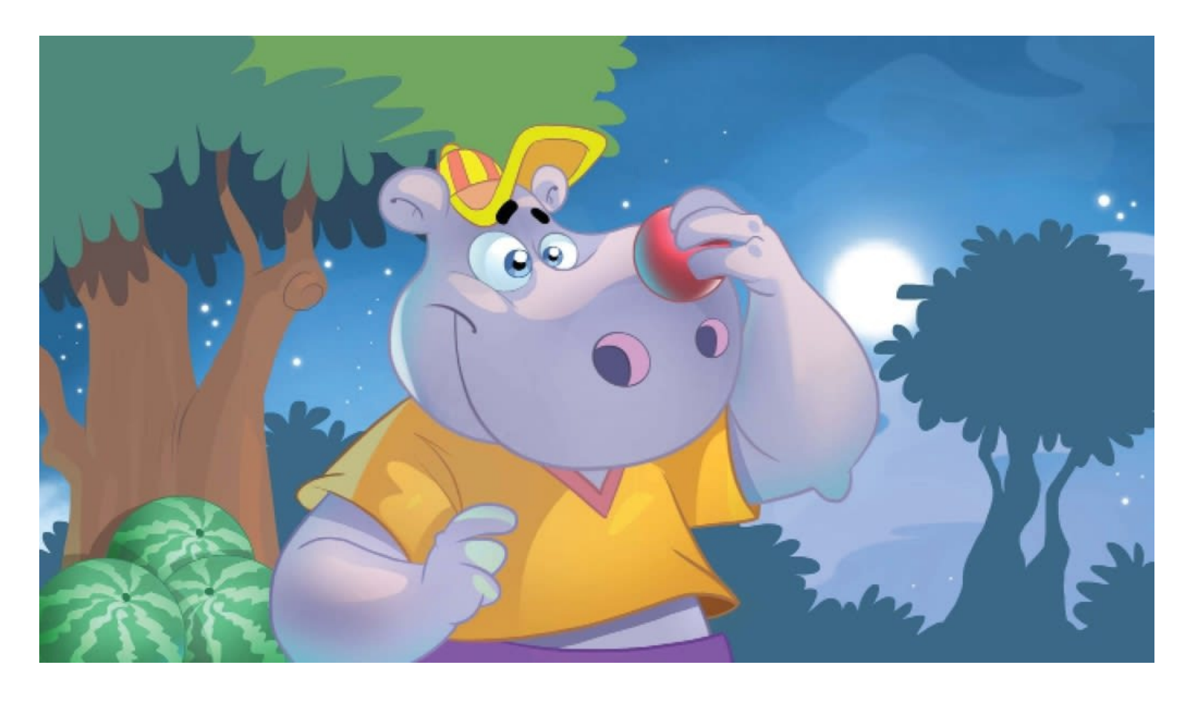
After the performance was over, Little Billy's eyes sparkled as he said to himself, "I think I know what I want to be."