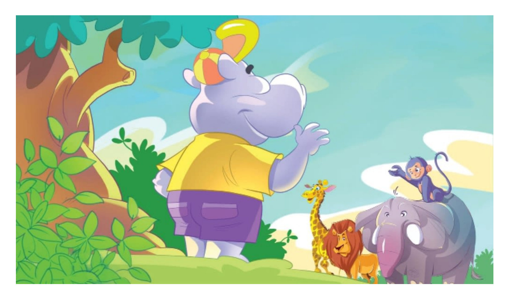
From that day on, the words "Great swimmer, great swimmer," played over and over in his mind.