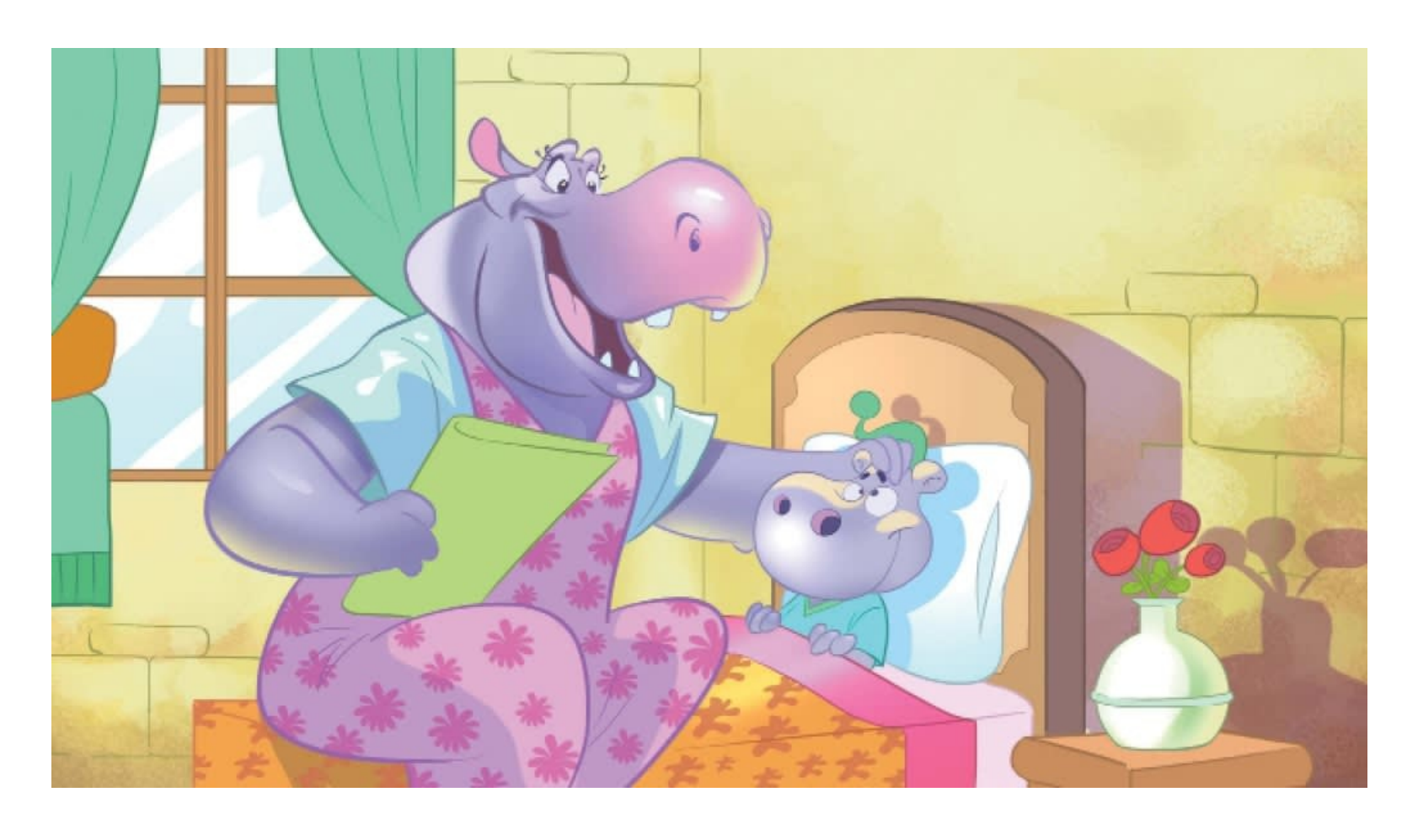
"Billy, my dear, what do you think you'd like to be?" Then she kissed him goodnight and he fell asleep.