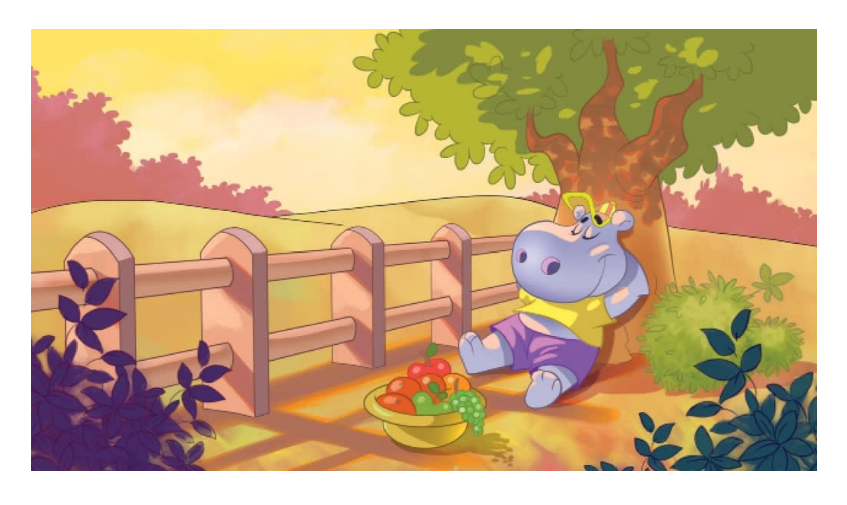
He had all he needed. There was plenty of water and plenty of food, so why think of anything else?!