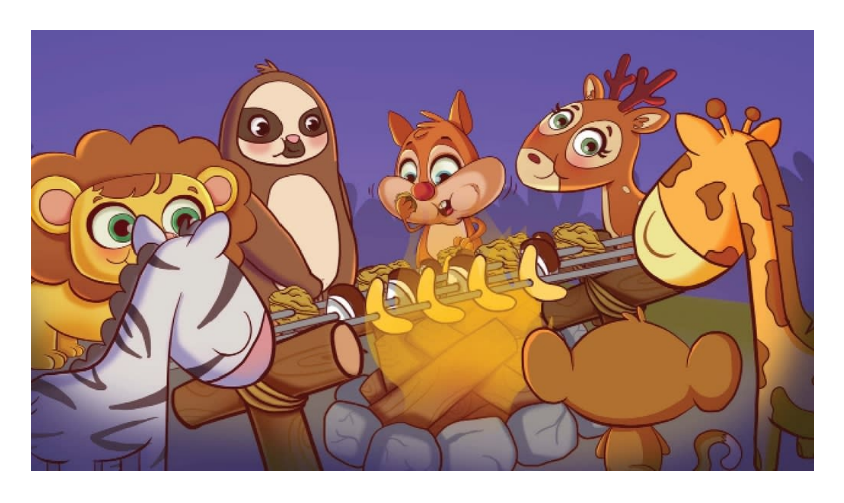
Everyone talked and ate.