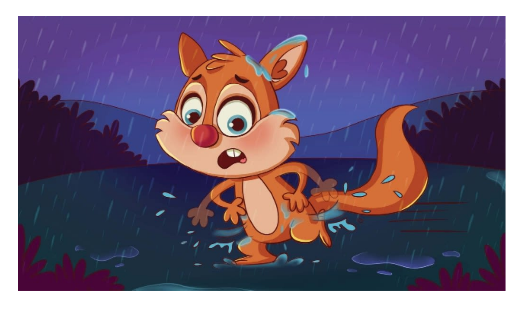
He shook the raindrops from his body and his tail and said, "I'll just have to explain."