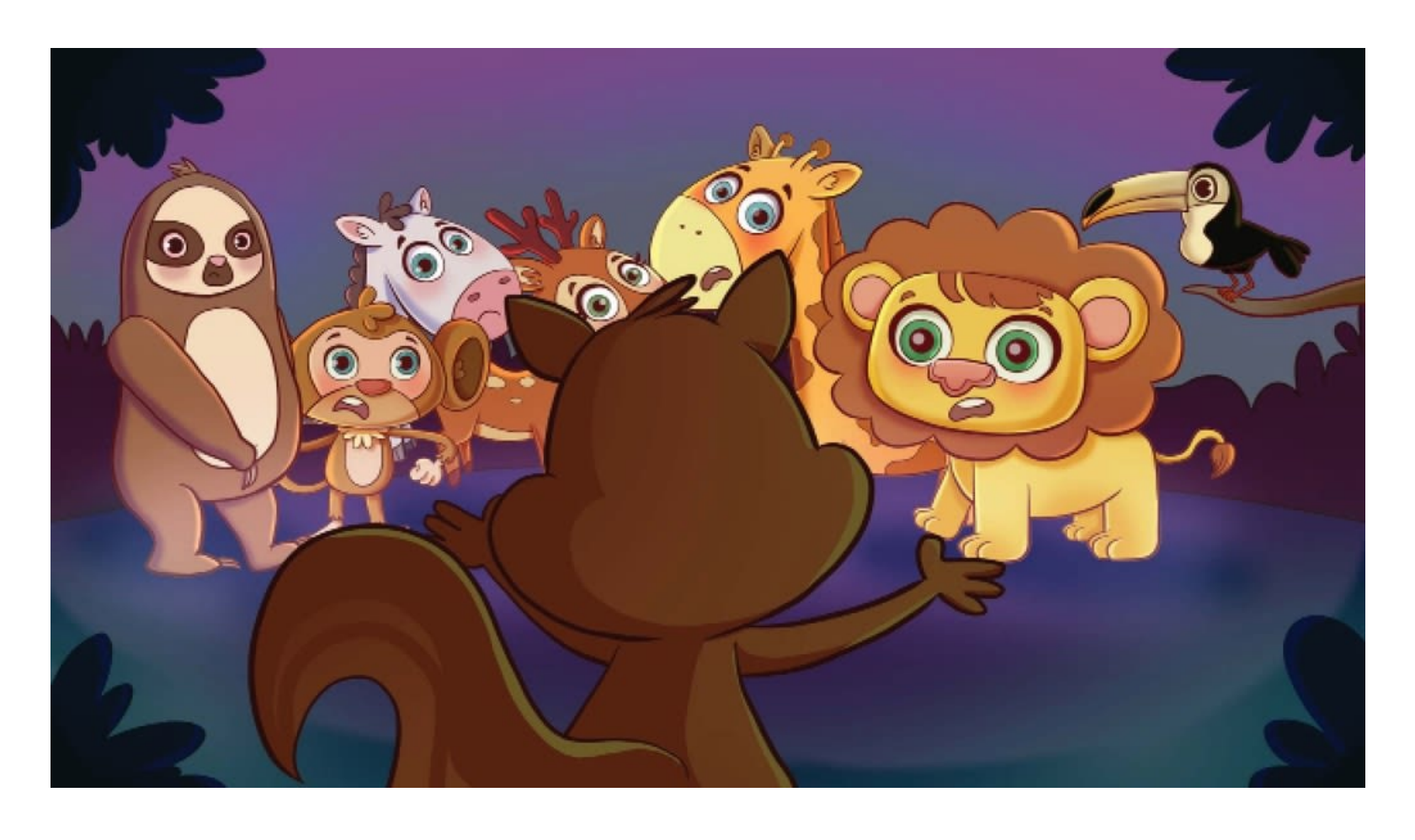
But, it was only squirrel. He said, "Come, my friends. I'm having a barbeque just for you. It will be so much fun."