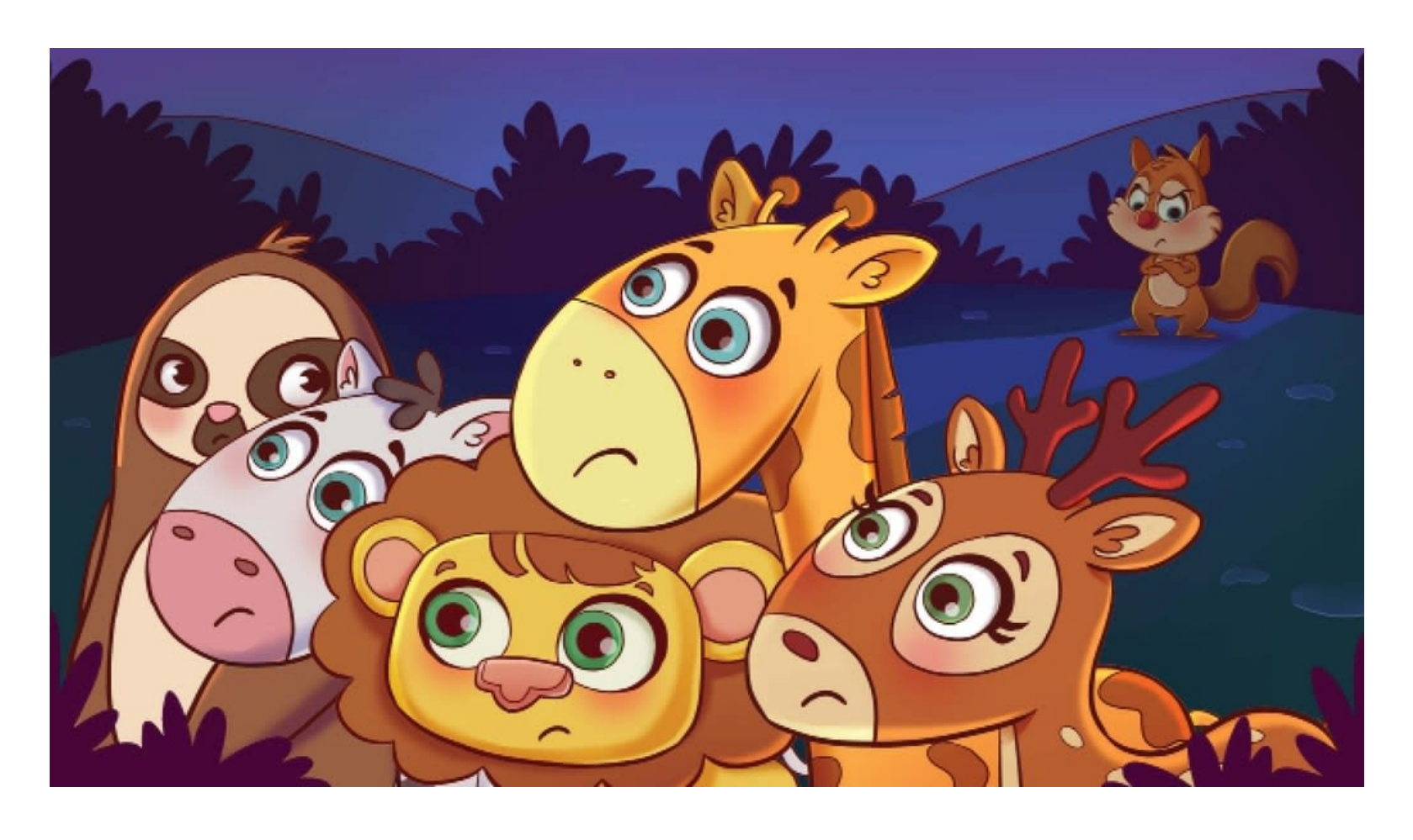
The animals were surprised. They didn 't say a word. Then they left.