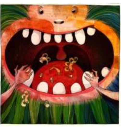
Had enough? Never!