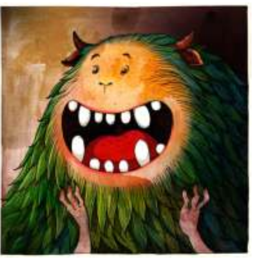
Any good? Very good!