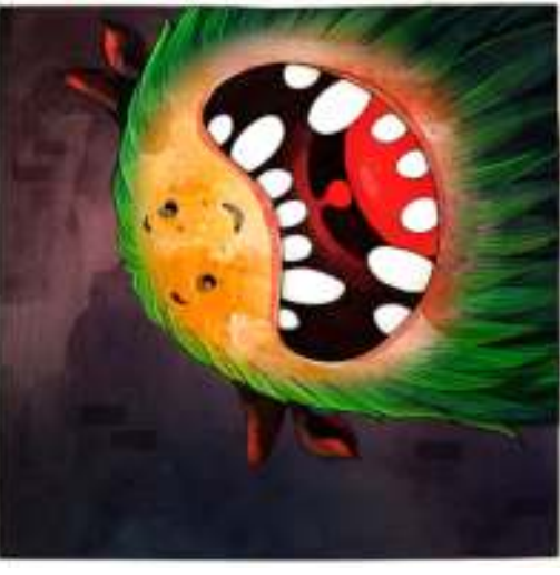
What feast? Lakhamari feast!