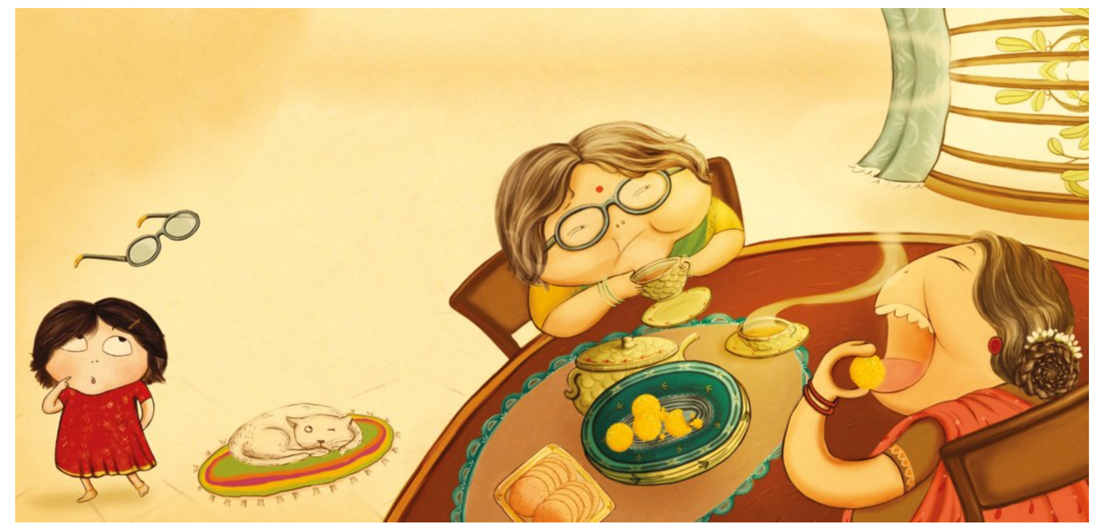
I decided to be a good detective. I decided to find out what she had done all day.