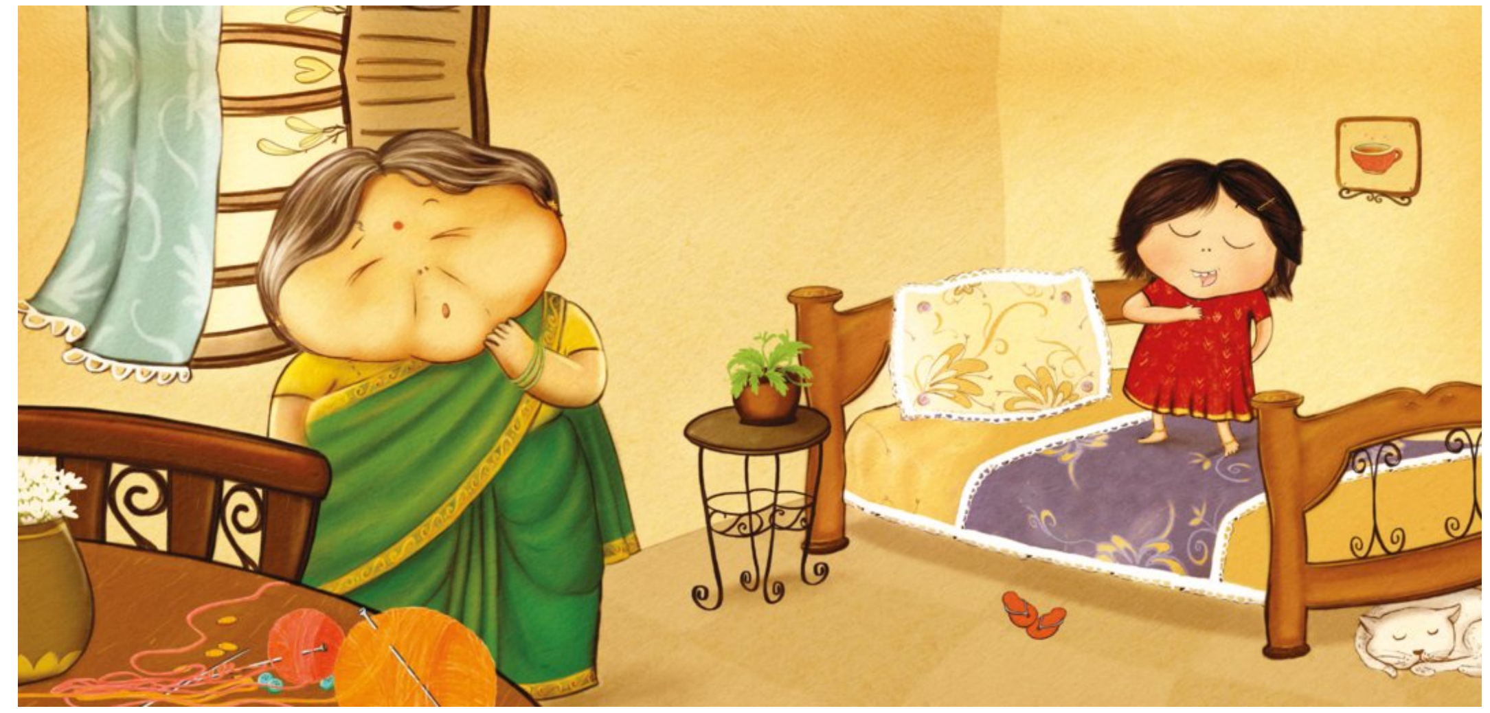
Nani keeps losing her glasses.

"Where did I keep them?" she always asks. Without her glasses, she cannot find her glasses.