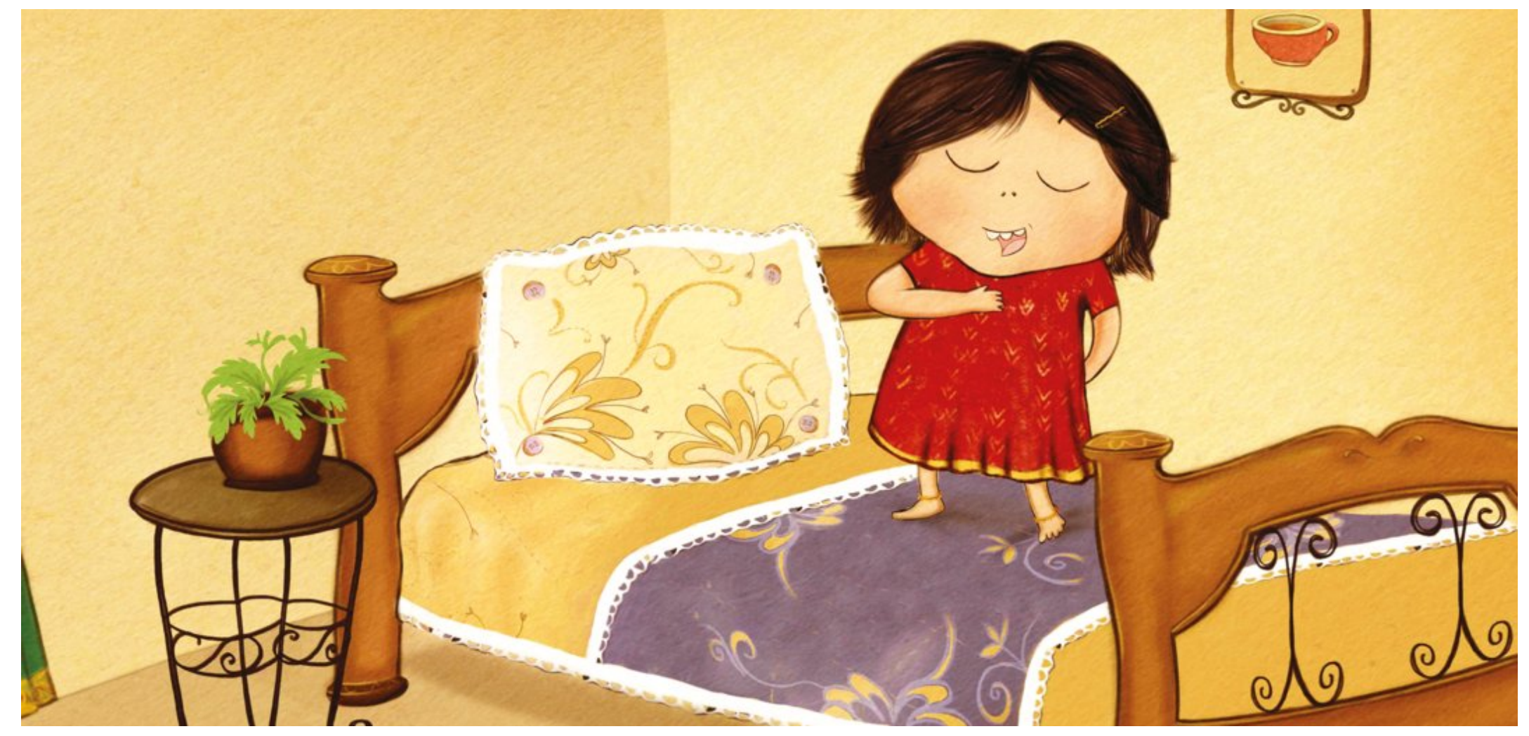
So she needs me. To be her eyes, to find her own eyes!