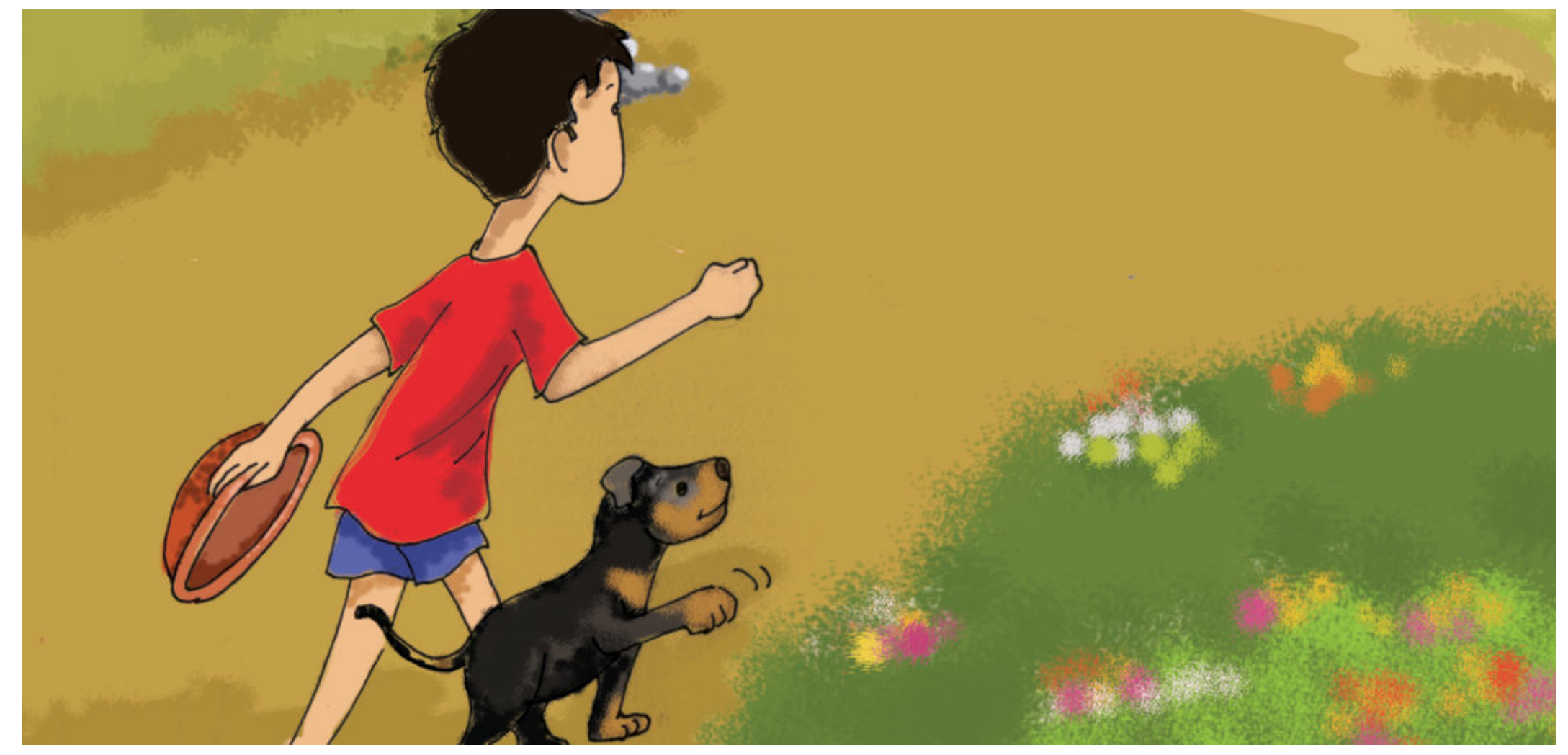
Maaloo went into the garden once more. Kaaloo followed him. Maaloo was looking for potatoes when he heard, "Woof! Woof!"