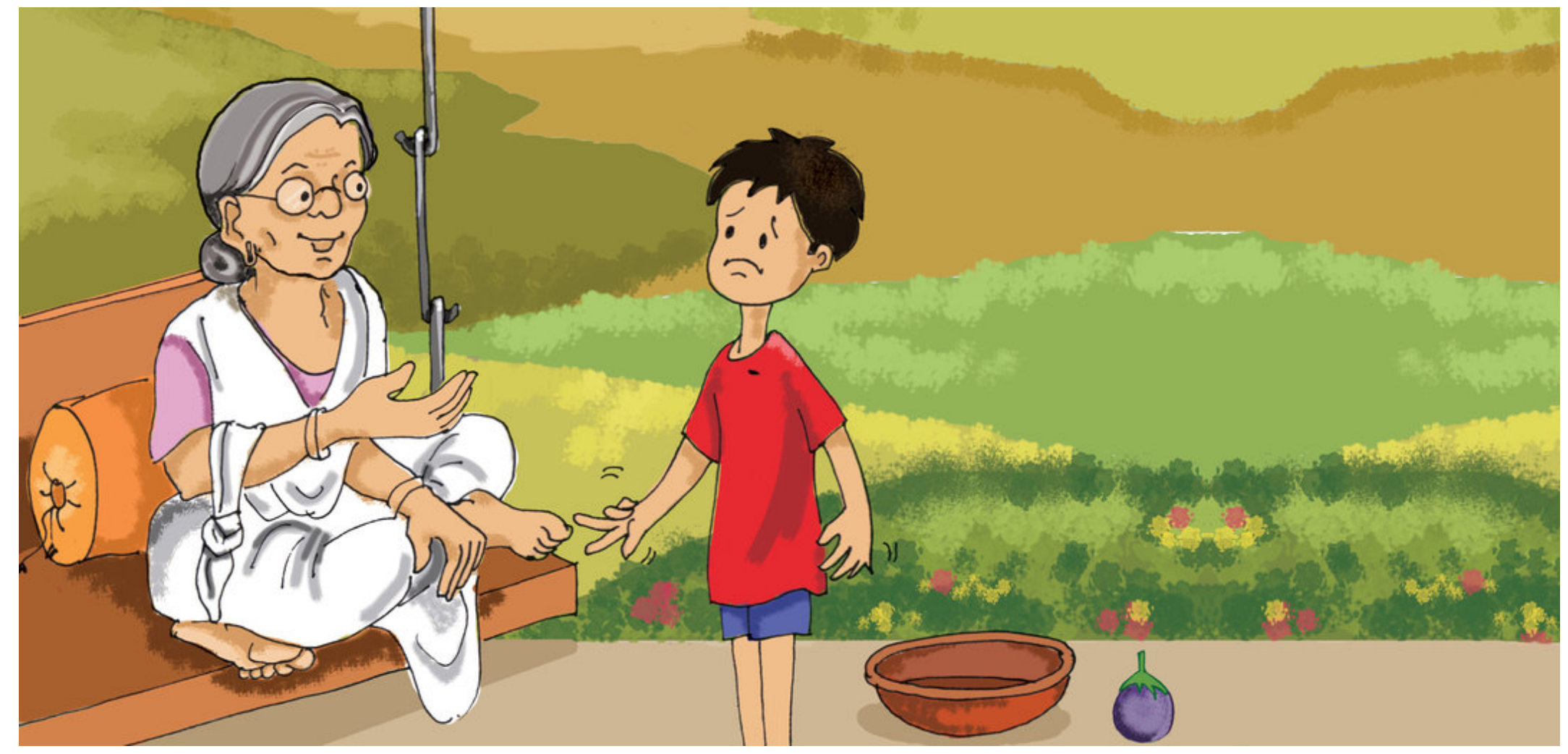
"Dadi, the potatoes aren't ready yet," said Maaloo, putting the empty basket down.