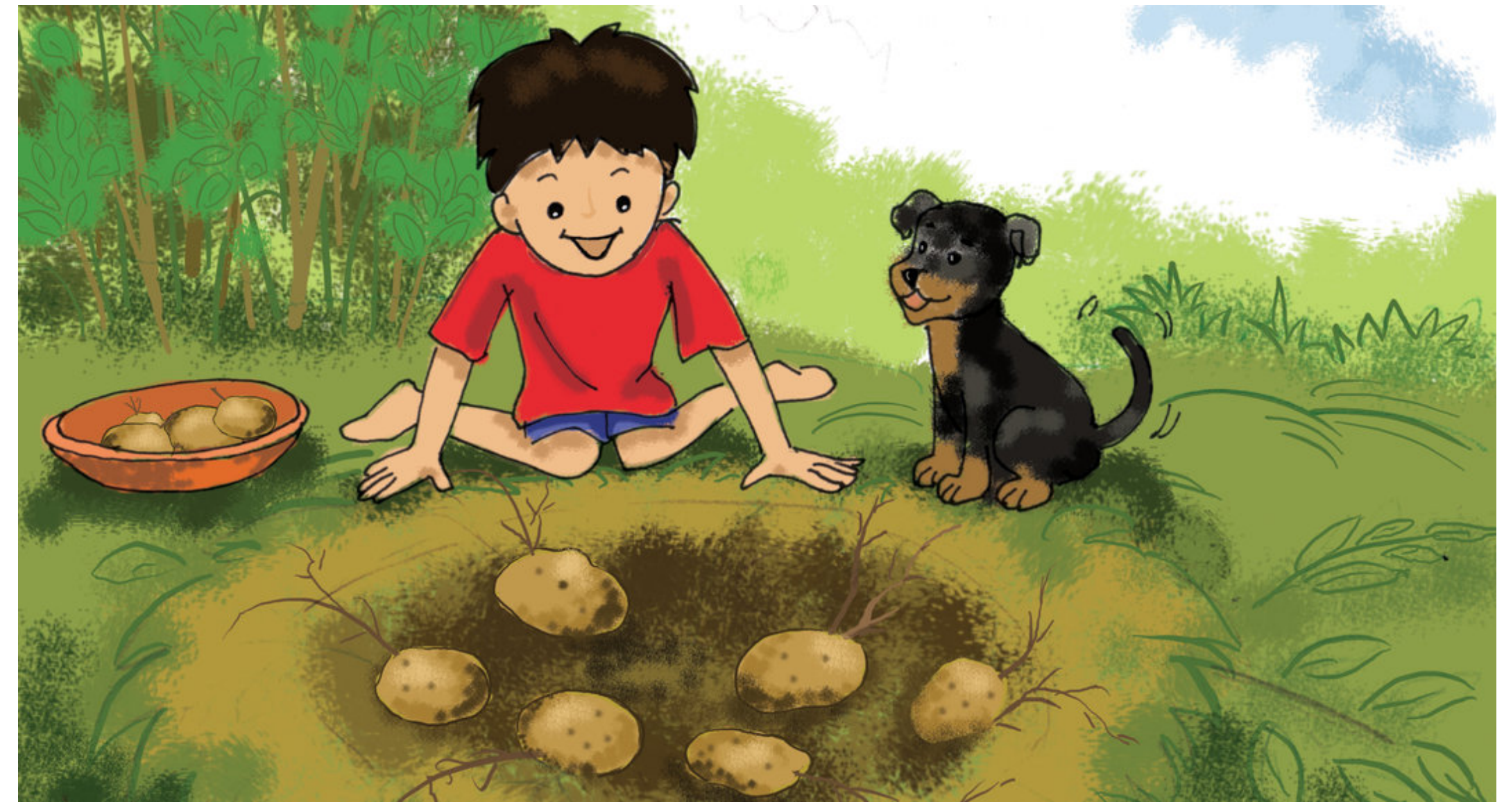
"Well done, Kaaloo. You found the potatoes!" laughed Maaloo, filling his basket with potatoes.