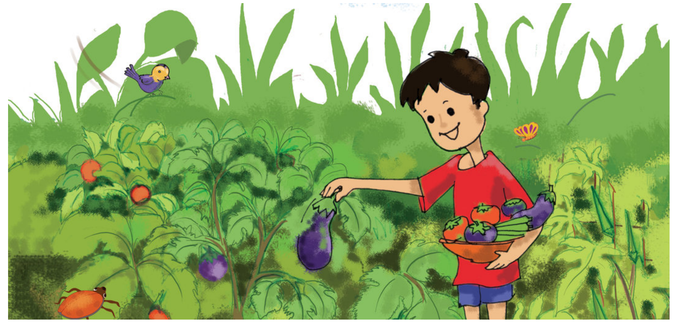
For the very first time, Maaloo is collecting vegetables from the garden. He has collected red tomatoes, fresh brinjals and green lady's fingers.