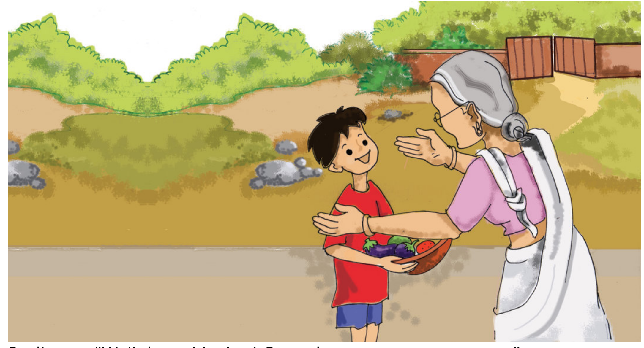
Dadi says, "Well done, Maaloo! Go and get some potatoes too."