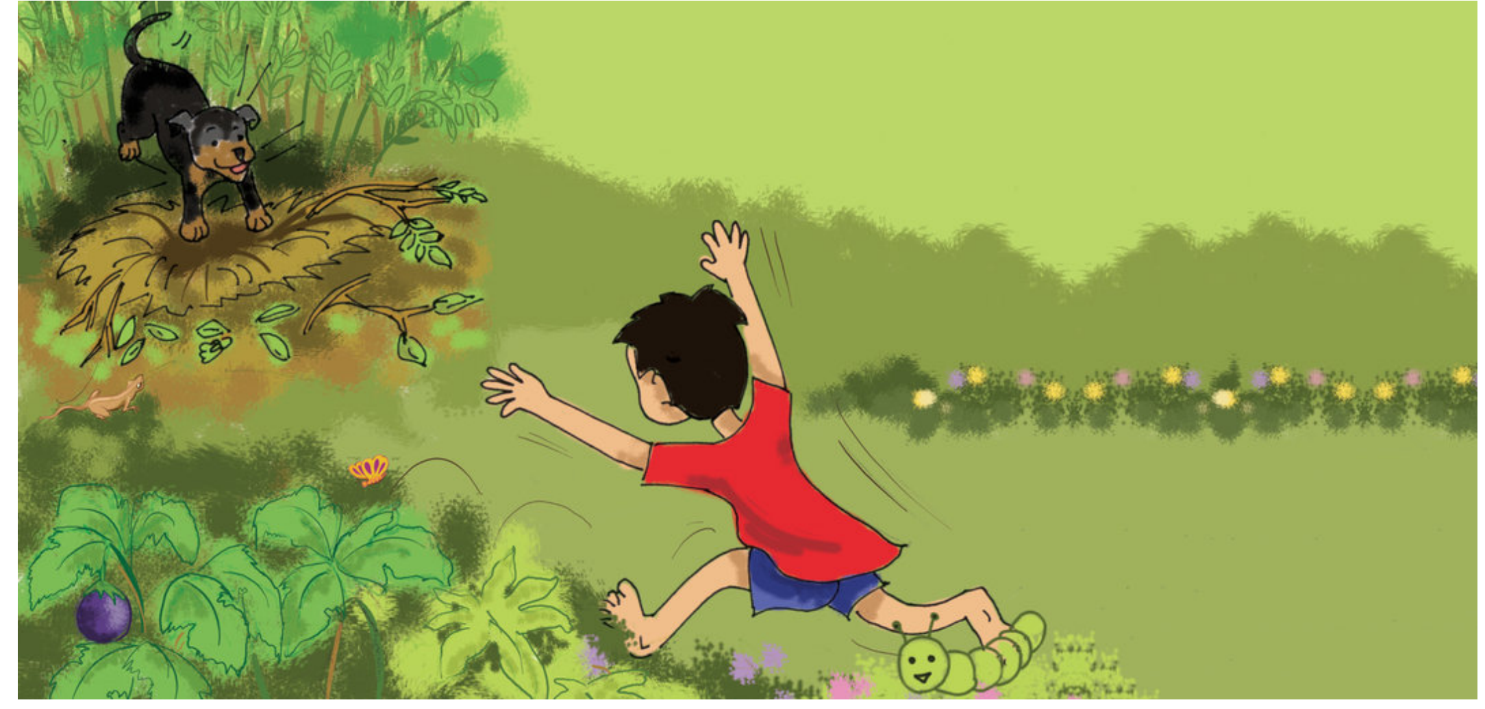
"Kaaloo! Stop, Kaaloo!" yelled Maaloo, running behind him. "Don't spoil the garden." Maaloo saw that Kaaloo was digging away and what do you think was coming out of the mud? Big fat potatoes!