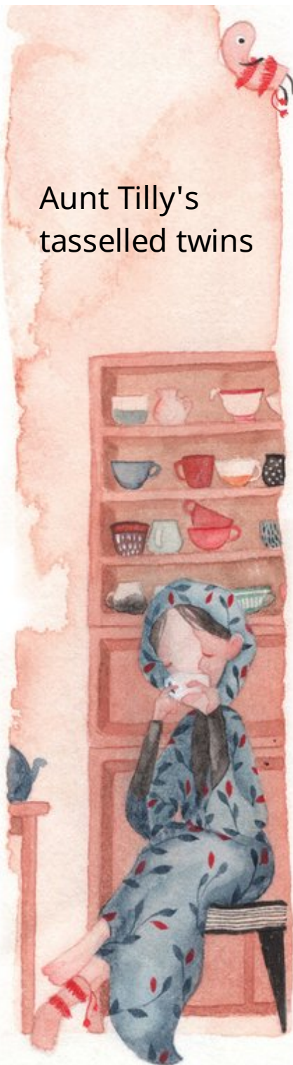
Aunt Tilly's tasselled twins