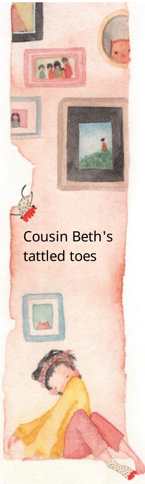
Cousin Beth's tattled toes