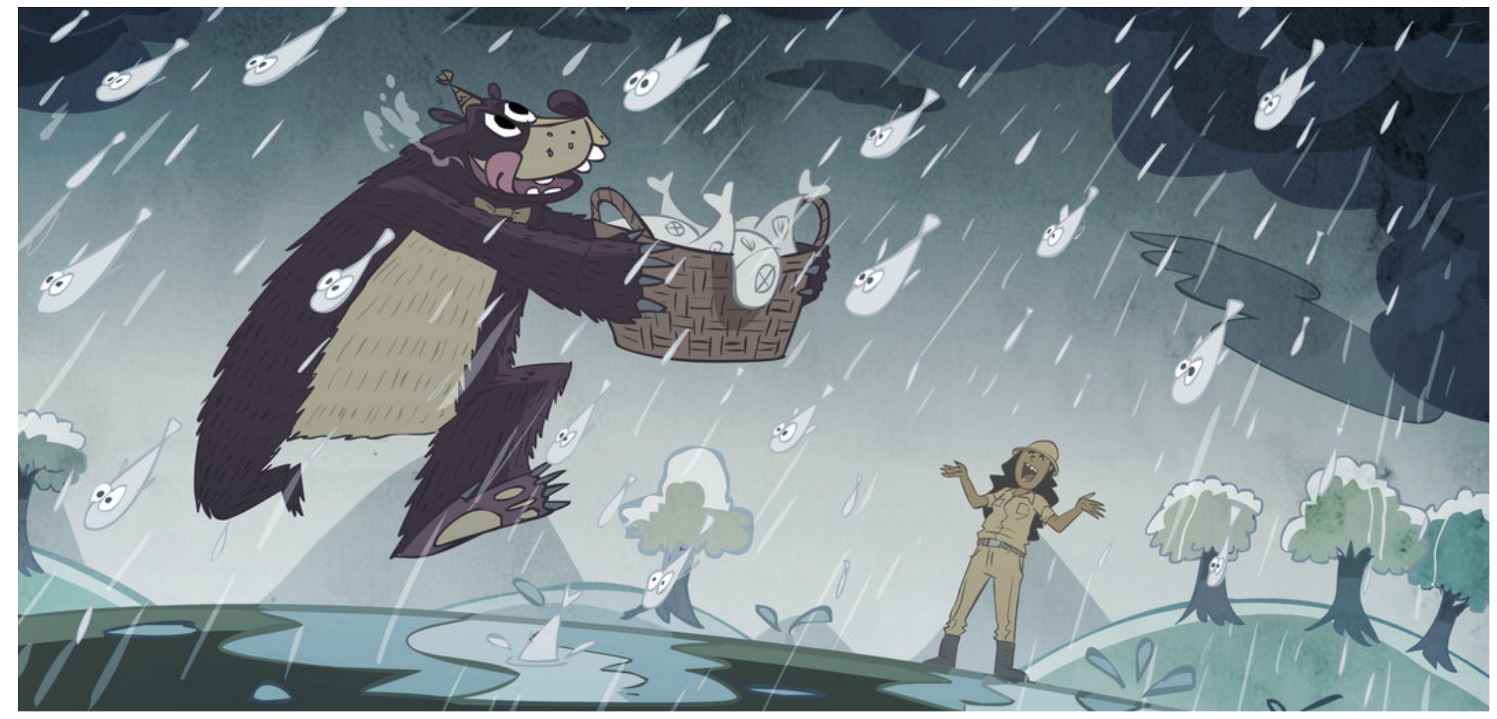
"Hey, it's raining fish," Avanti shouted.

Ballu looked around with wonder. Then he picked up a huge basket and ran around collecting fish as they fell from the sky.