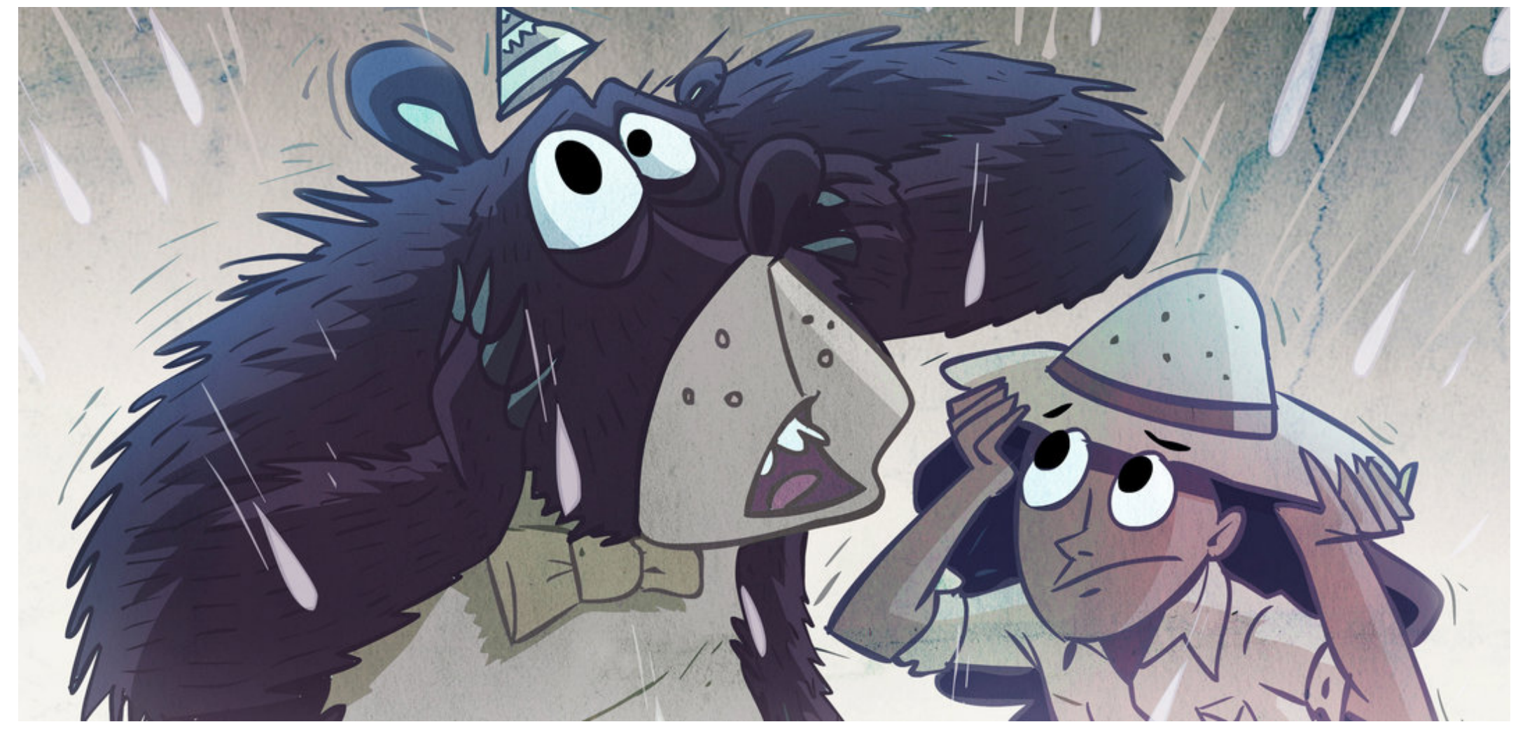
The blast of air blew the candles out. Then rising up, it crashed into the clouds in the sky. And all of a sudden, there was was a roar of thunder and it started to rain.