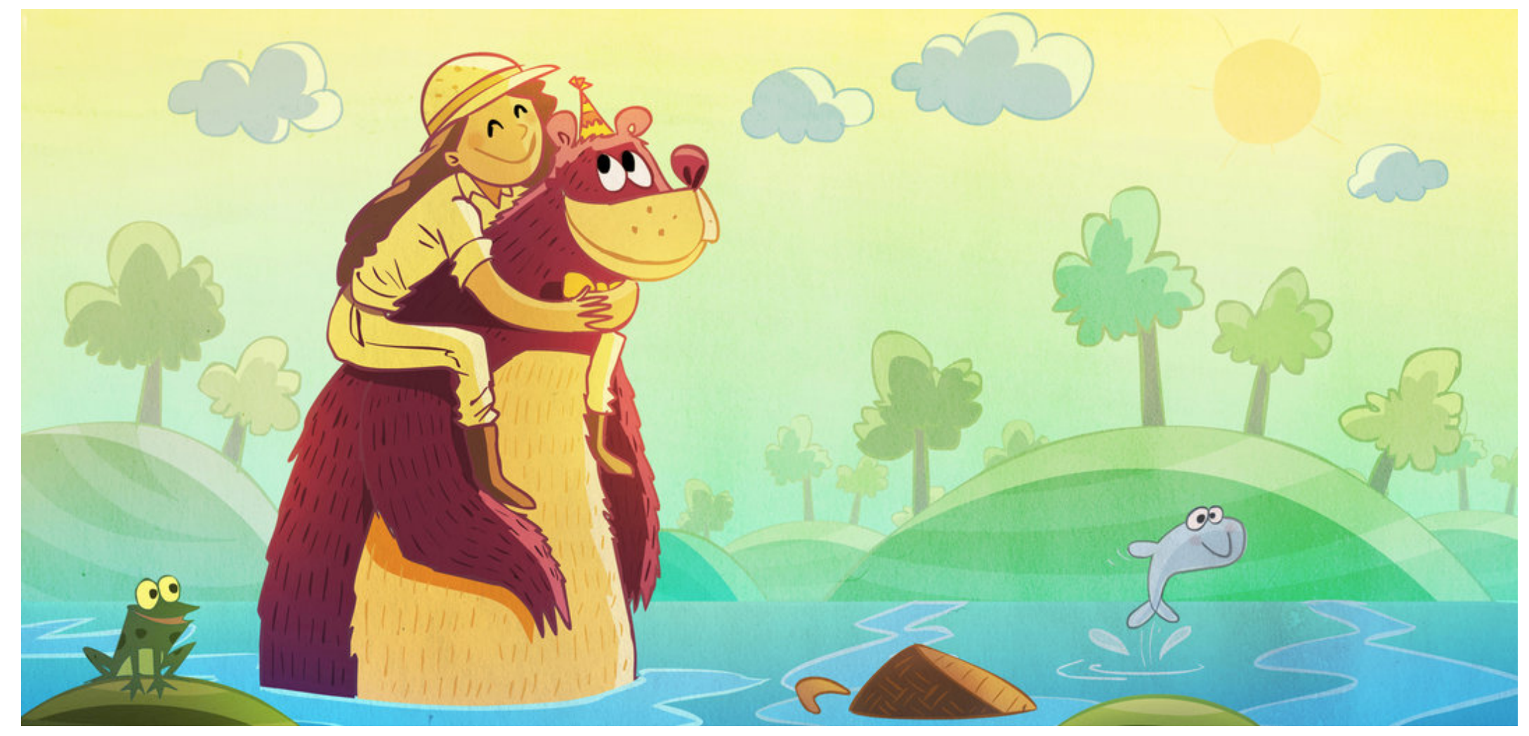
Ballu came back quickly, picked Avanti up and placed her on his shoulders. Avanti put her arms around Ballu's neck and thanked him.

Soon, the clouds disappeared and the sun came out. It was bright and cheerful once again.