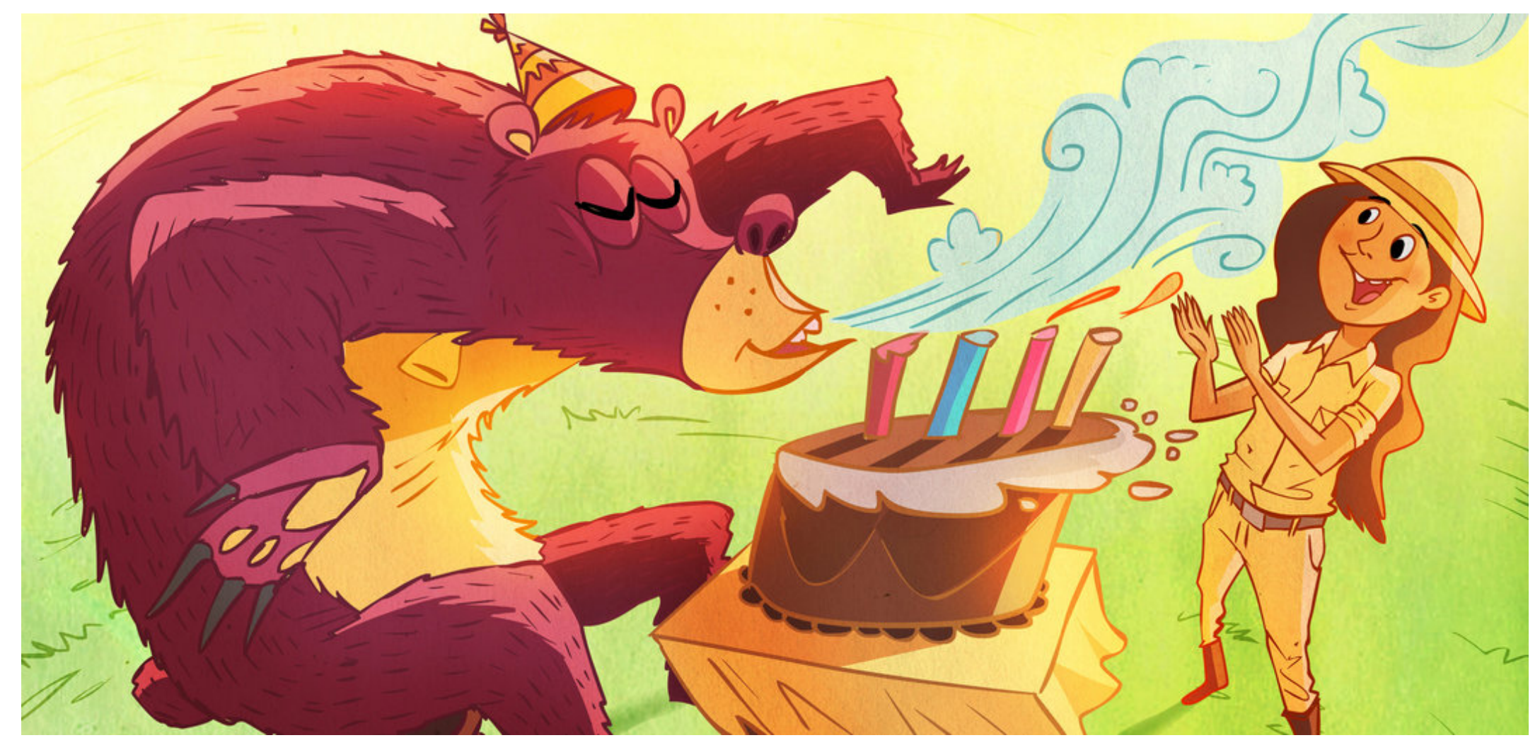
"Ballu, can you blow out all the candles at once?" Avanti asked.

"Of course!" said Ballu. He filled his chest with air. He huffed and puffed and puffed and huffed and went "WHOOSH!"