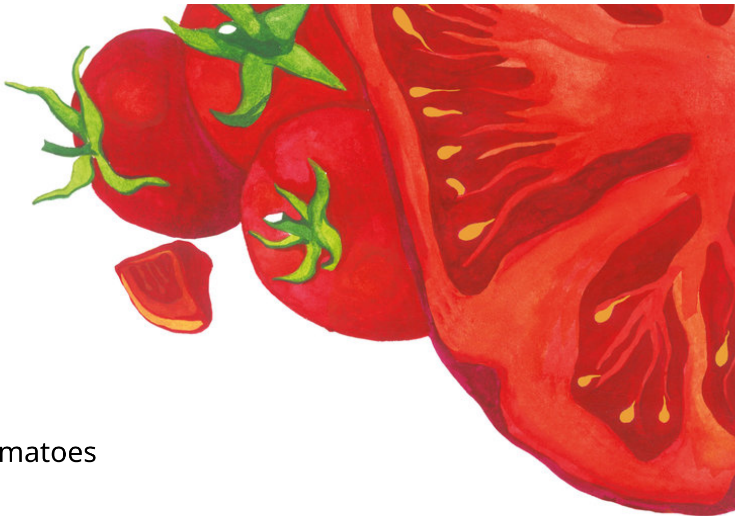
Juicy red tomatoes