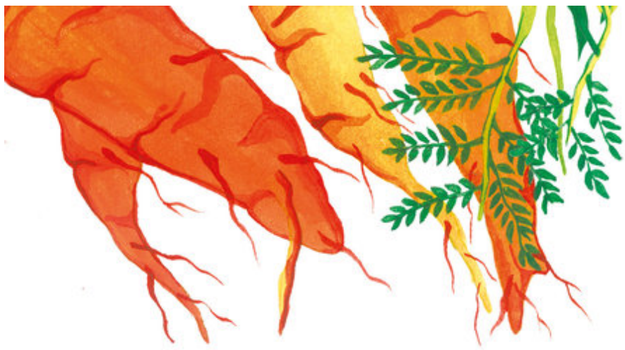
Crunchy orange carrots