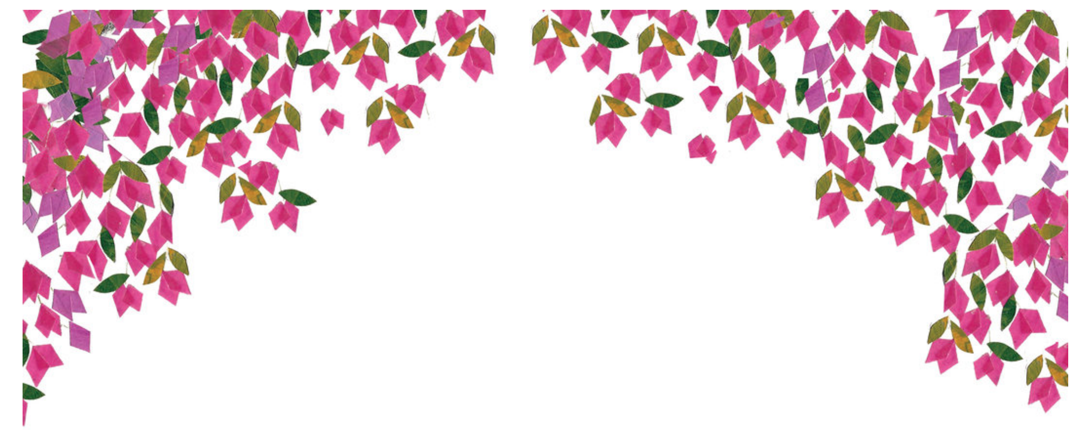
He ties Lalita up under the shady bougainvillea.