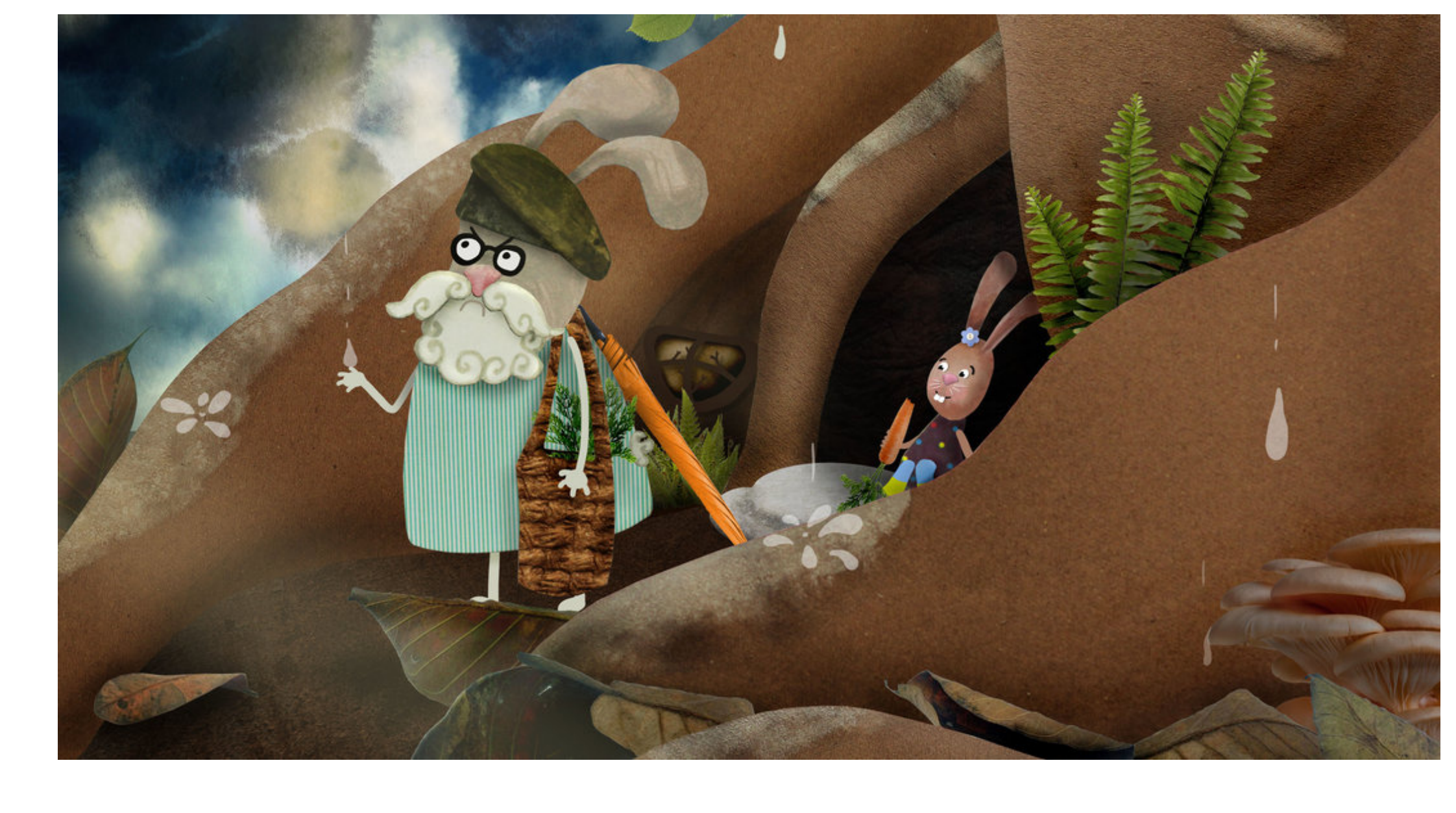
Ajja is about to step out of the house. He looks up at the clouds. Why is he hurrying back into the house?