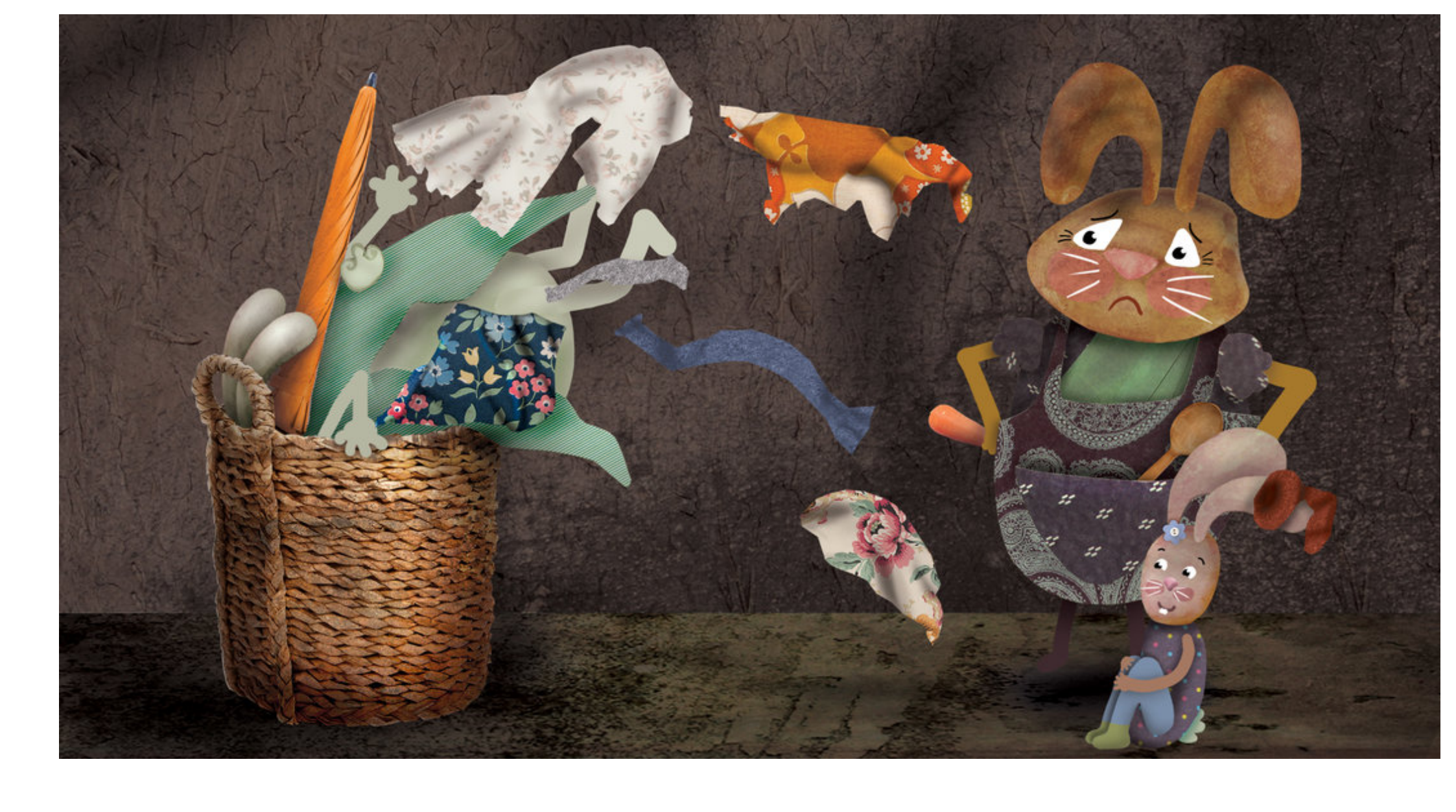
AIYO! Ajja's toes are in front of Dinku akka's nose.