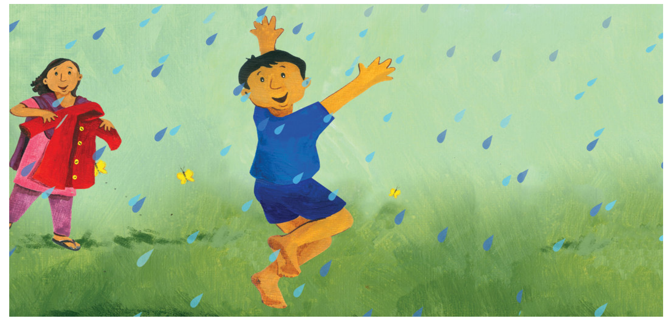
"But Manu," called Ma, running after him, "you forgot your raincoat!"