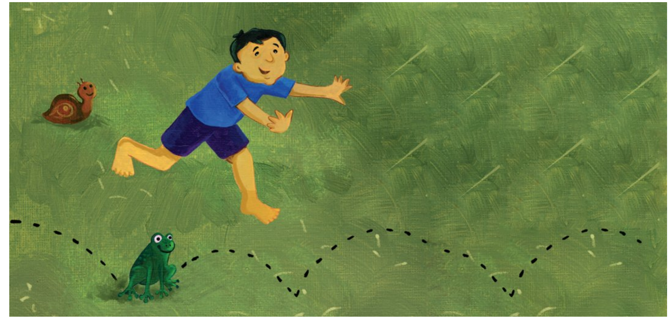
Saturday began with a bang!