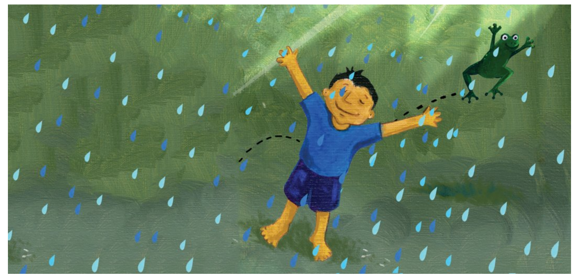
And then at last, it started raining! "Oh, it's raining, it's raining," sang Manu, running out.