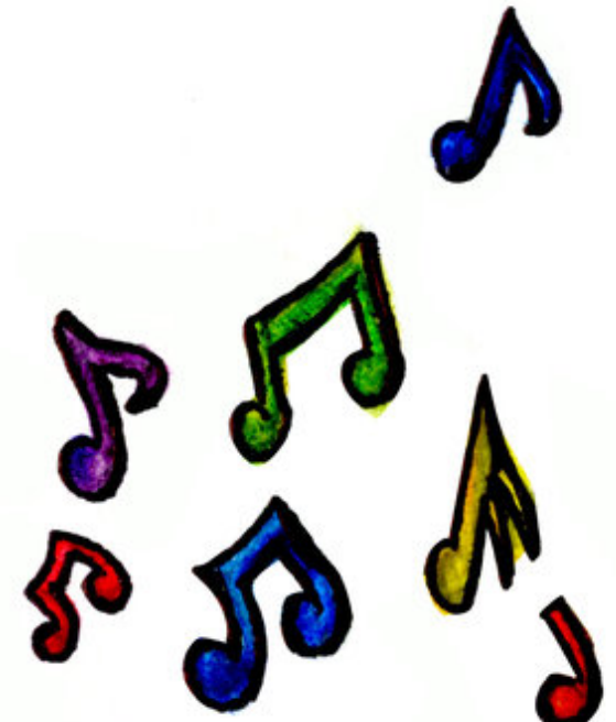
Tabla - Zakir Hussain