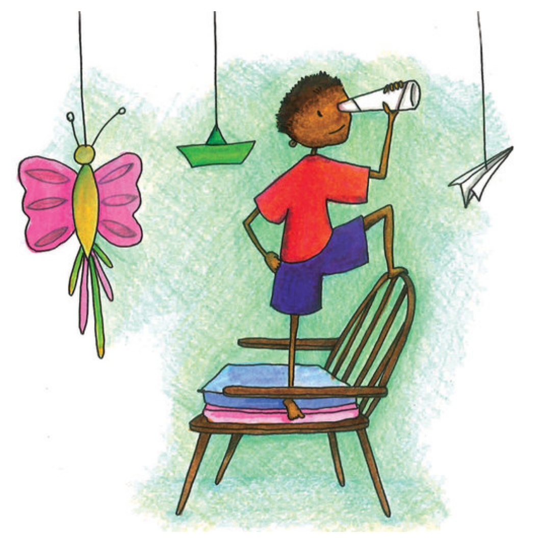
I am a big boy now. I can draw and I can make things.