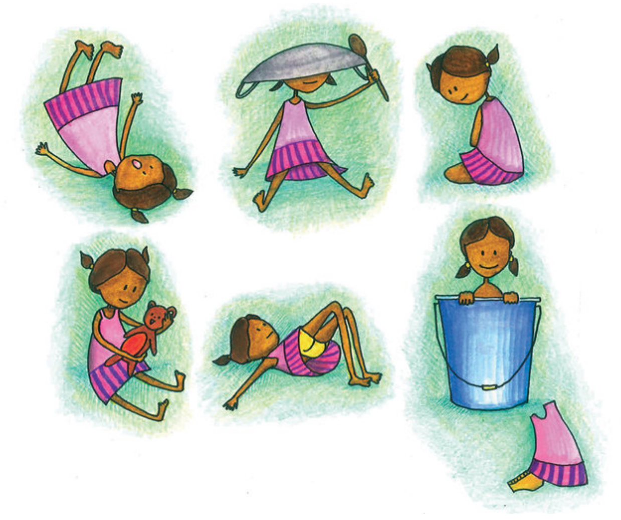
I draw my sister, she does not sit still.