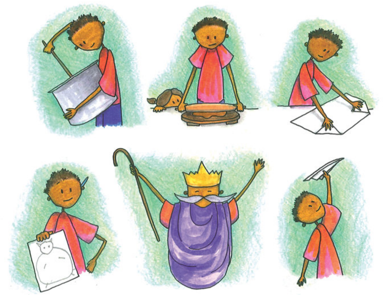
I can make things.