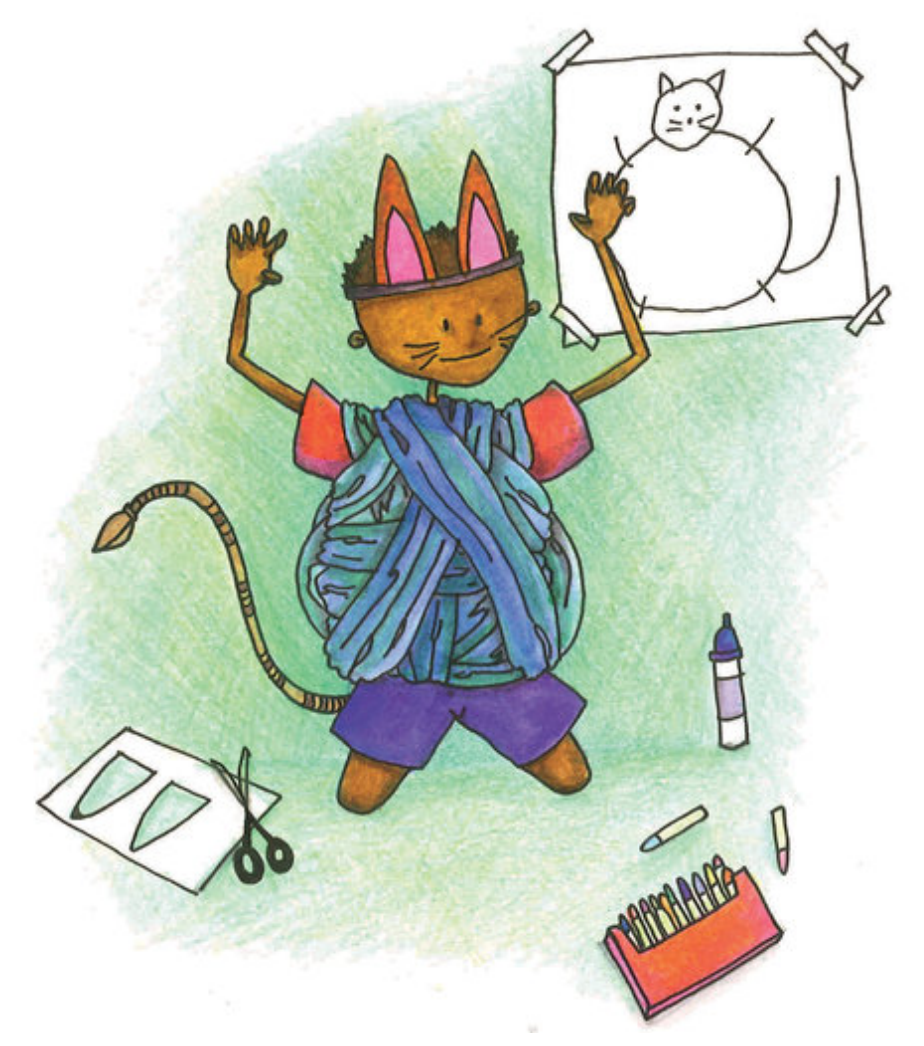
I make a drawing of a cat, she is fat.