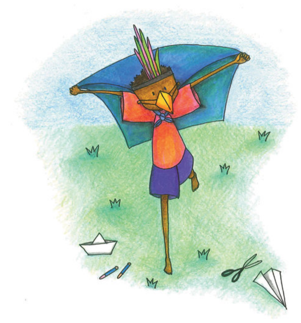
I make paper boats, birds and planes.