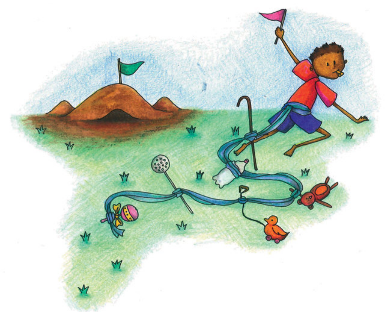
I make houses and trains.