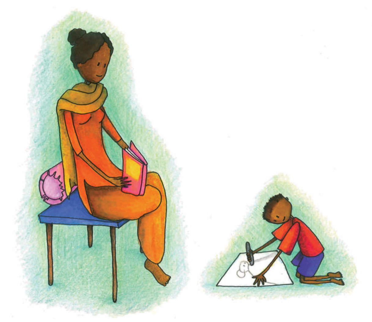
I draw my mother, she sits still.