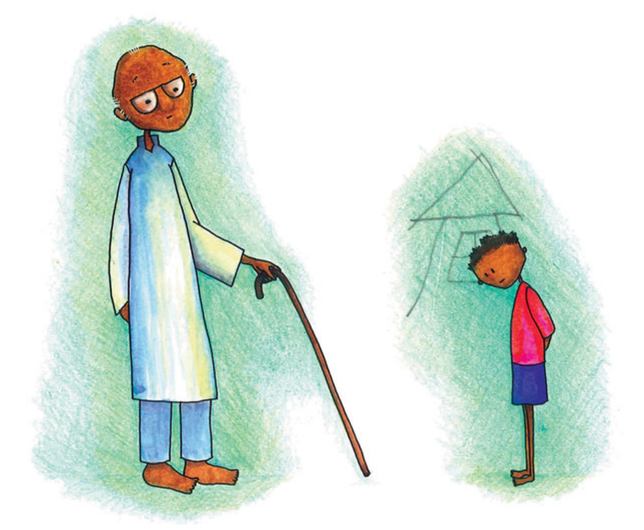
But I am told not to draw on the wall.