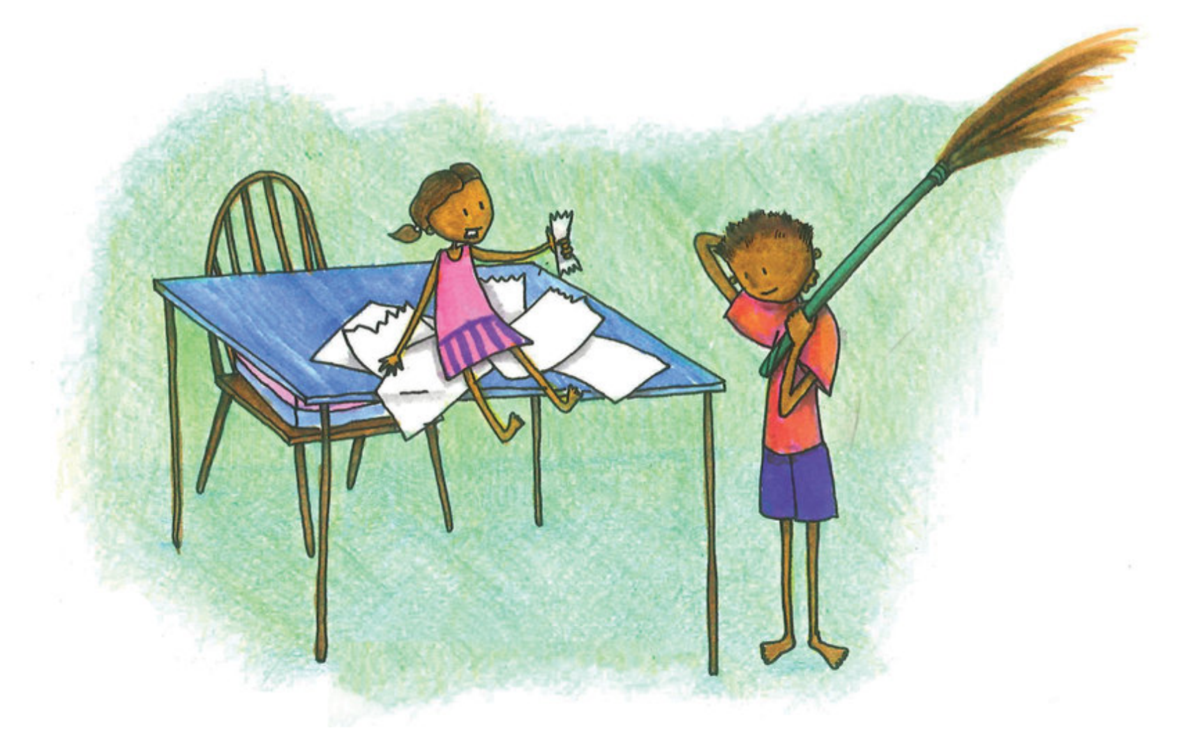
My sister makes a mess! I can make many things. But my sister cannot!