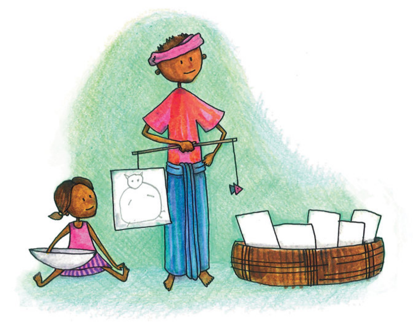
I make a fish. It is small.