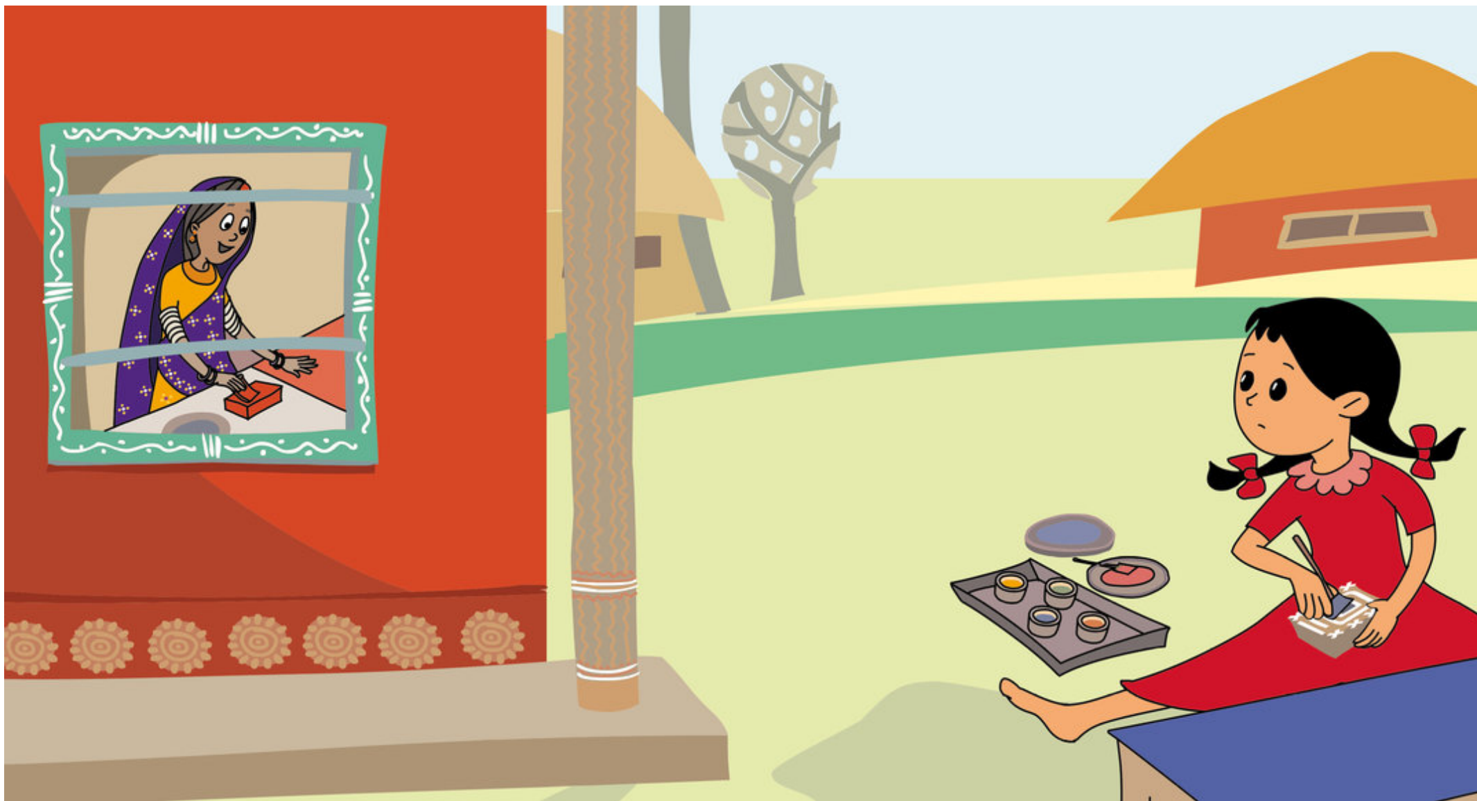
Sona sat at a small table outside.