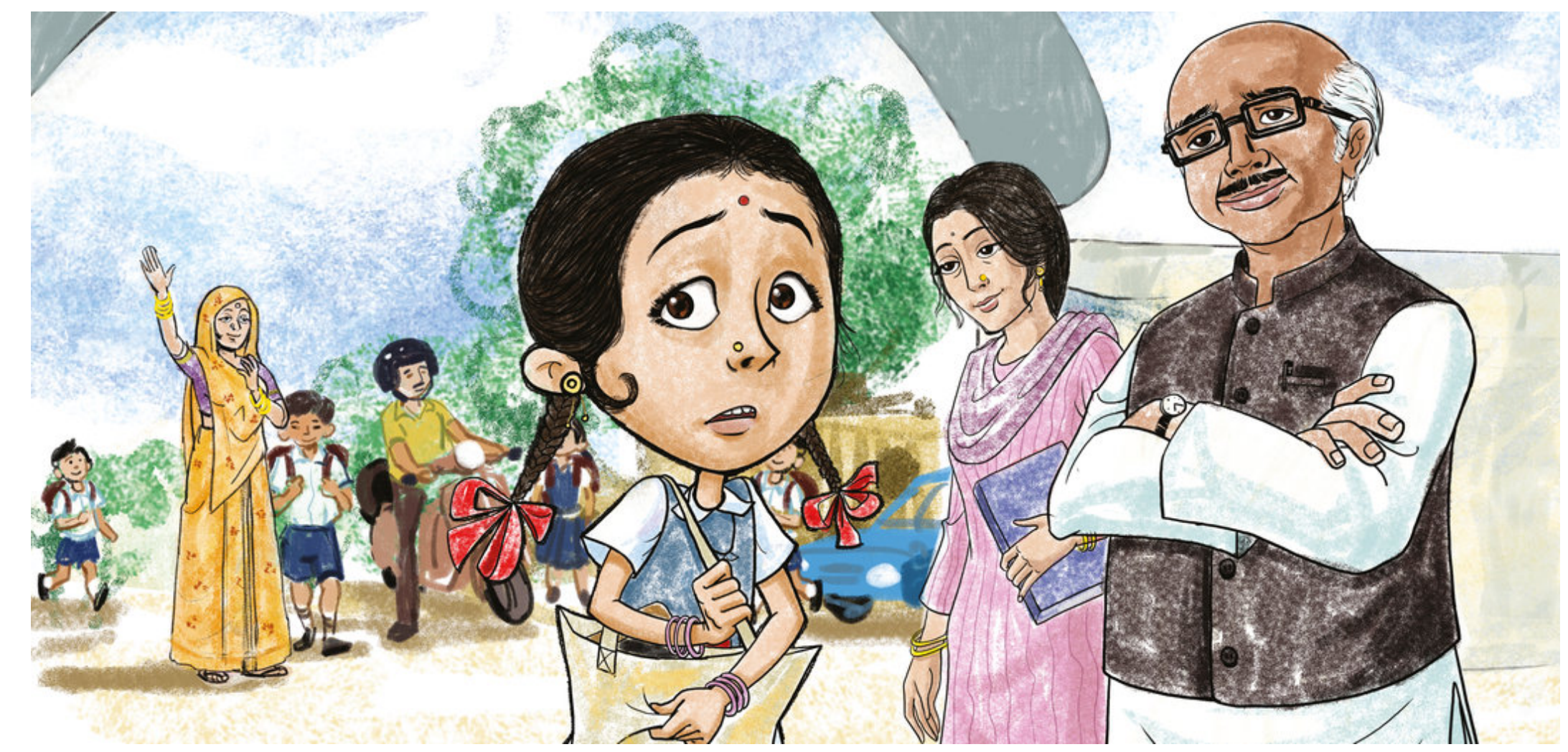
We reach the gate. Mummy lets go of my hand. She stays at the gate. I have to go inside alone. There are many new faces all around me.