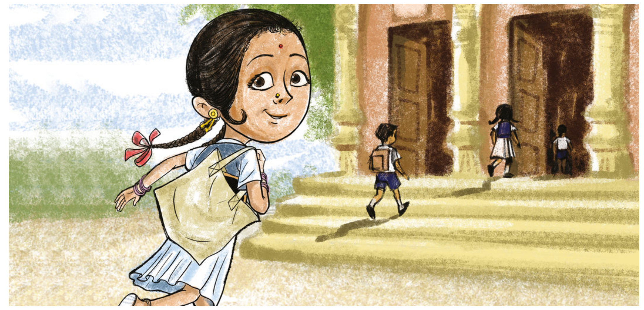
I run inside. Mummy will be there after school!