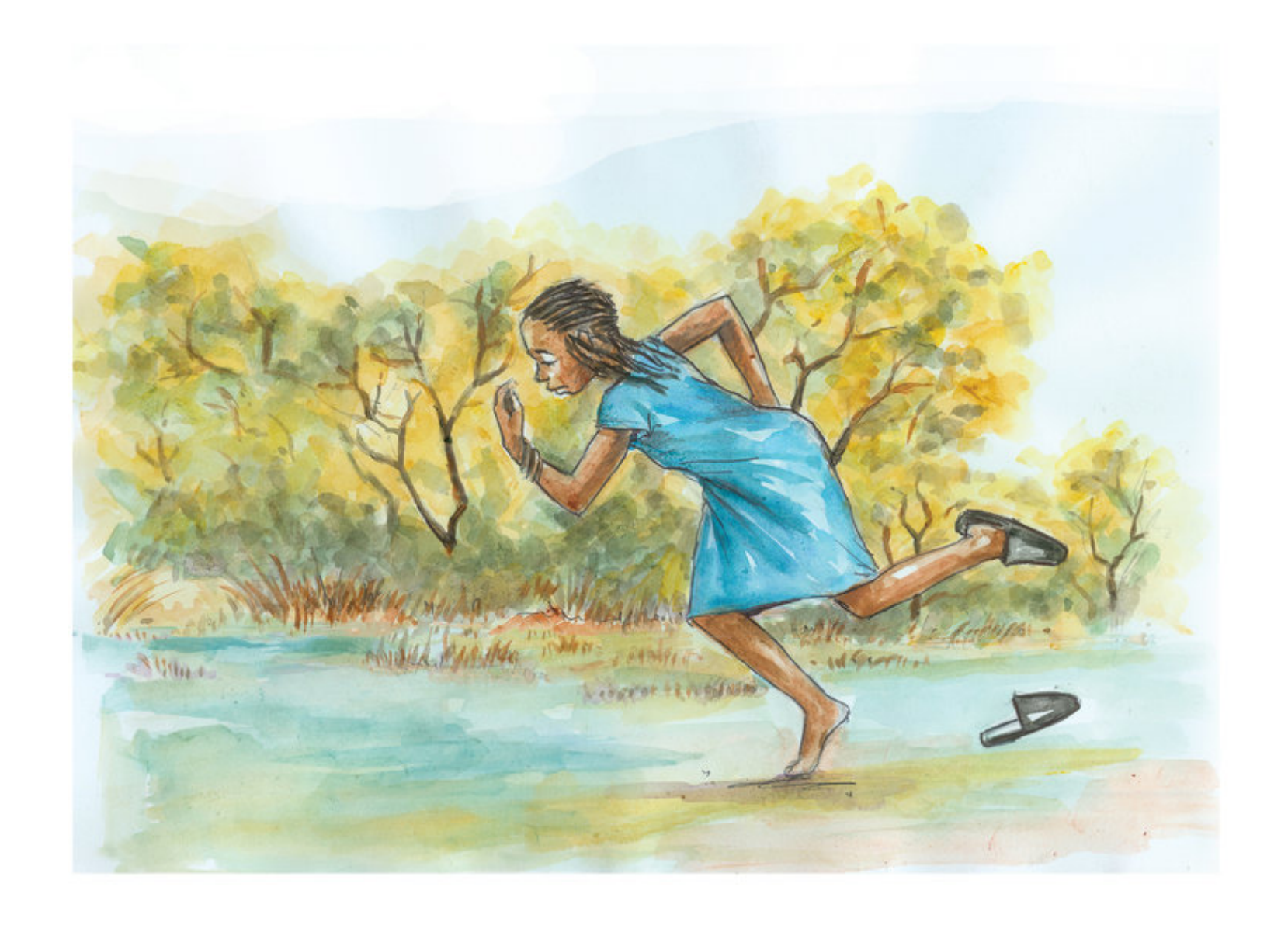
Fati screamed, "Eii!" Fati ran very fast to look for her mother and father.