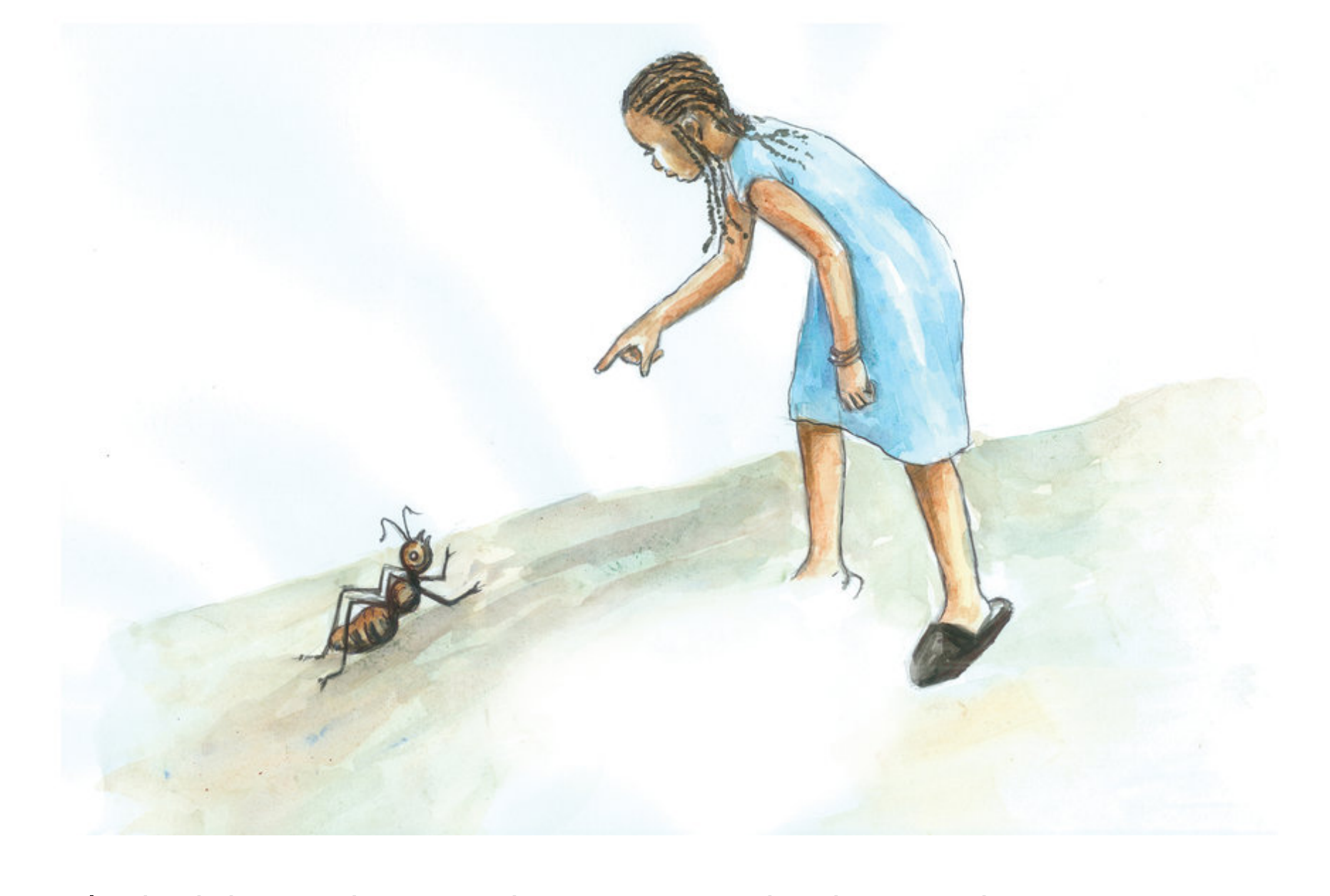
Next Fati looked down. She saw a brown ant on the dusty path.