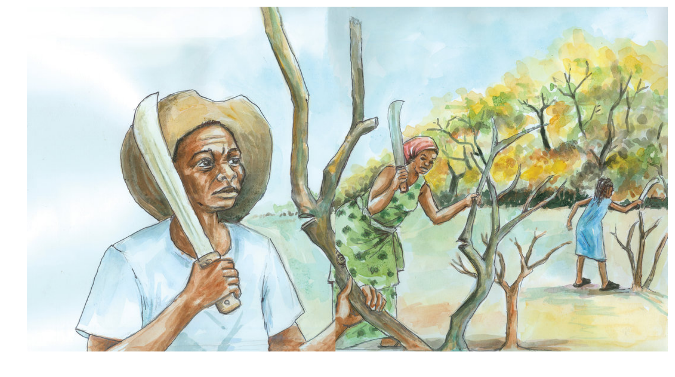
Soon her mother and father got very busy.