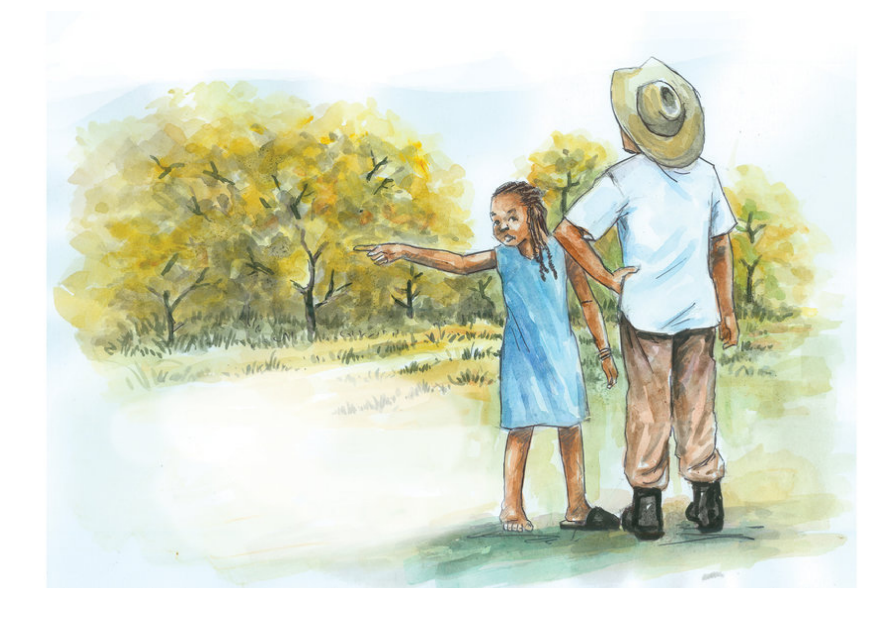
Fati saw her father. Fati said, "A snake! A snake!" Father said, "Where? Where?" Fati said, "There! There!"