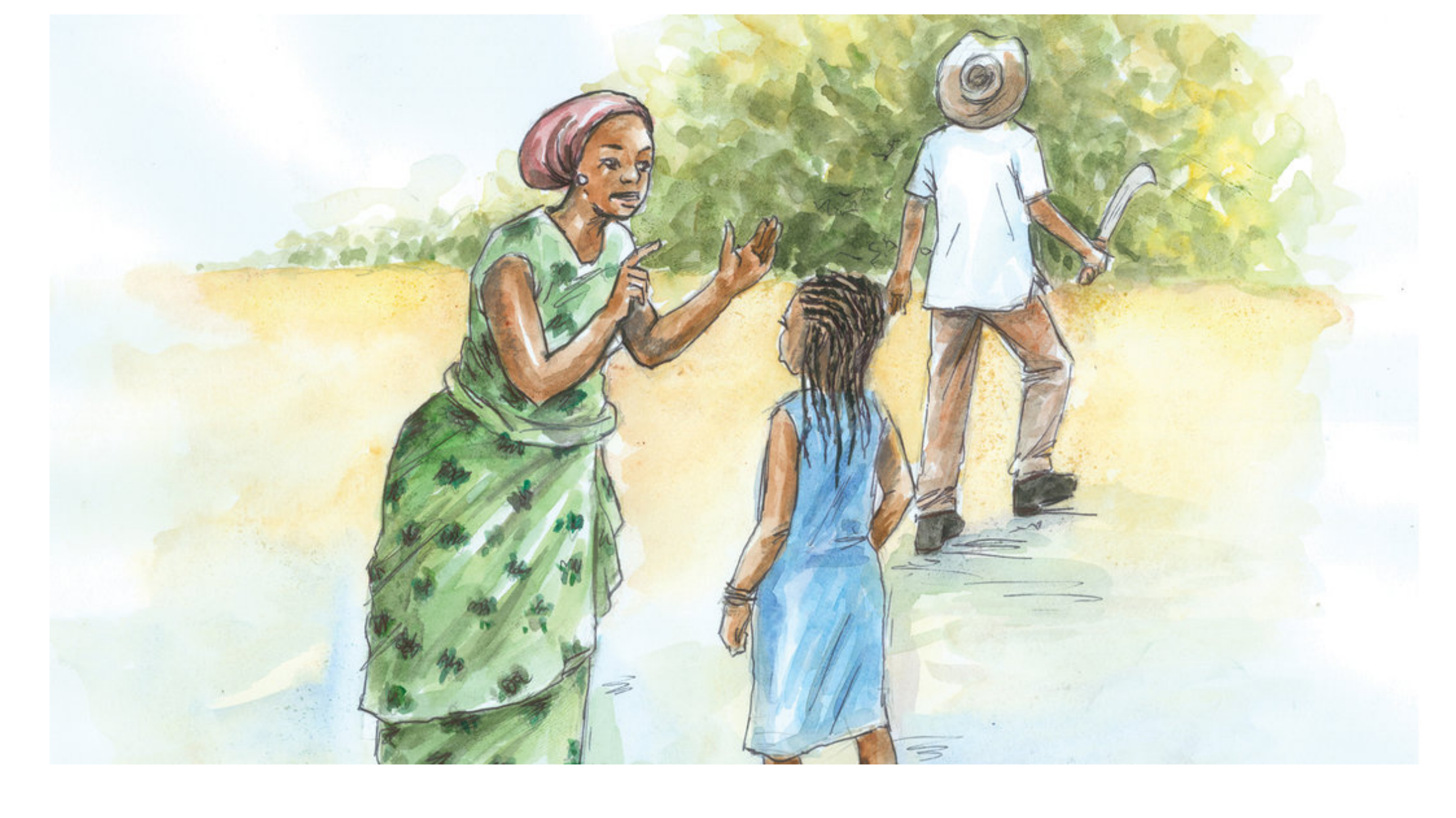
...but next time, please, please, look where you go, and be very careful."