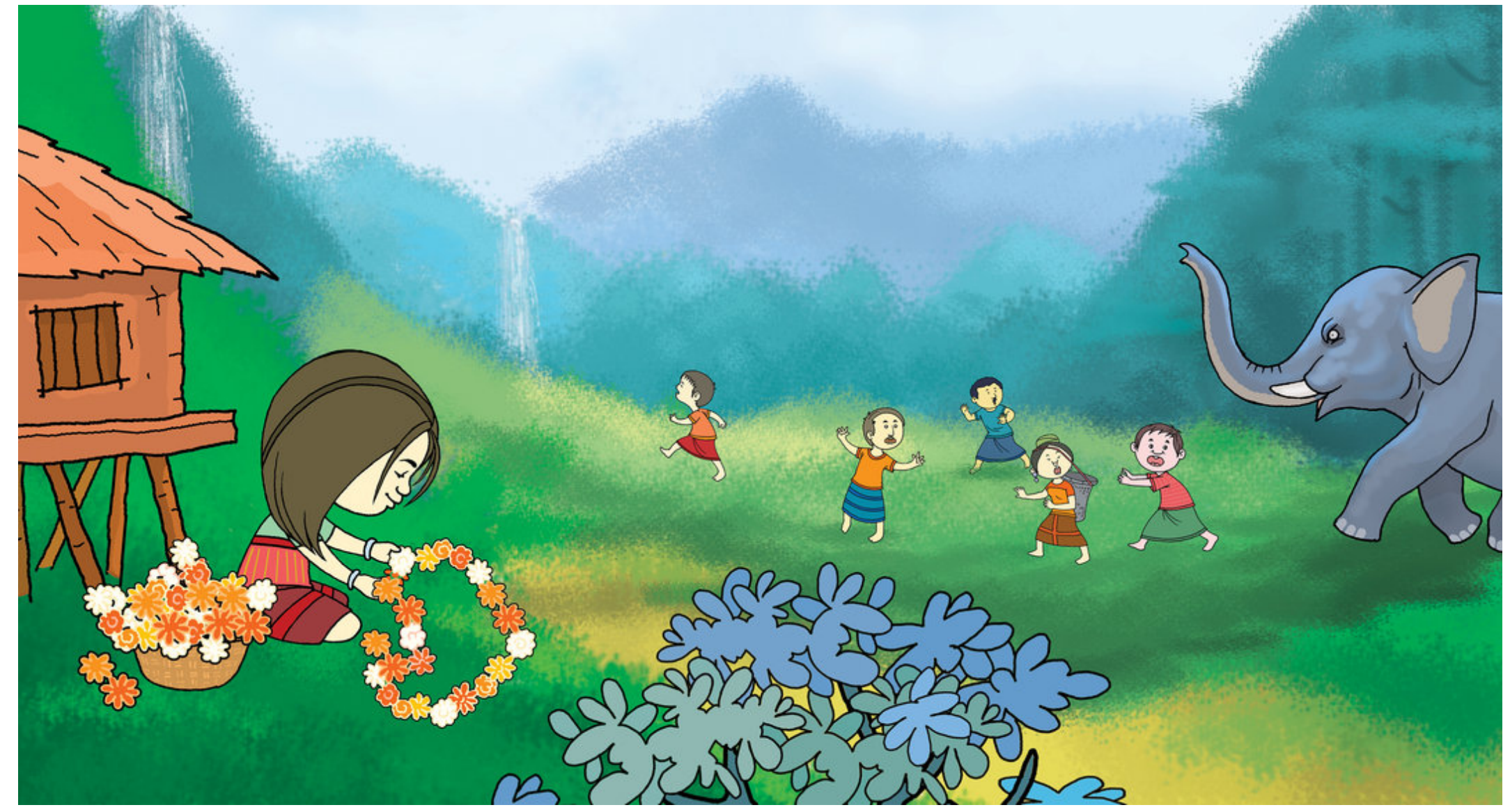
One afternoon, Girisha sits outside her house making wild flower garlands when an elephant approaches the village.