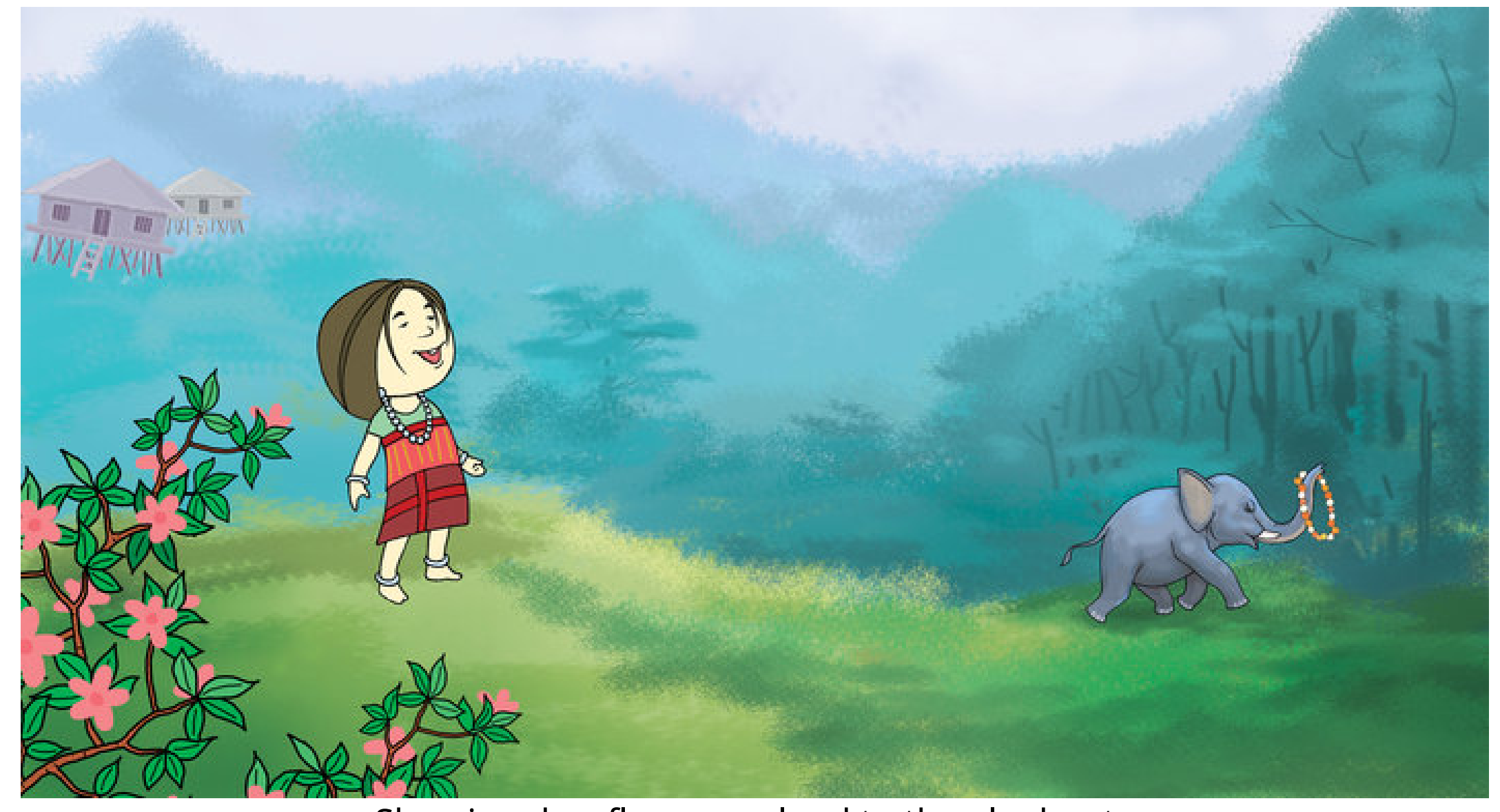
She gives her flower garland to the elephant, and he goes back into the deep forest.