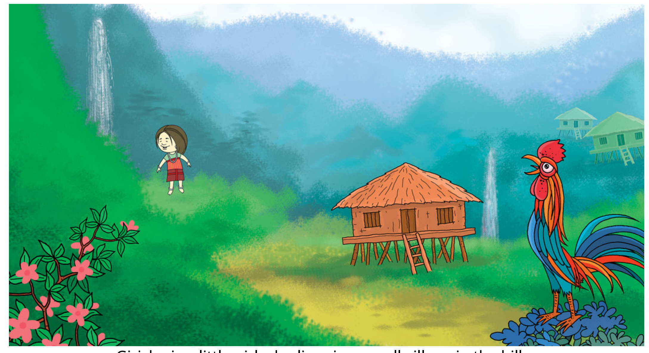
Girisha is a little girl who lives in a small village in the hills. Her house is next to the waterfalls. She wakes up to the crows of roosters.