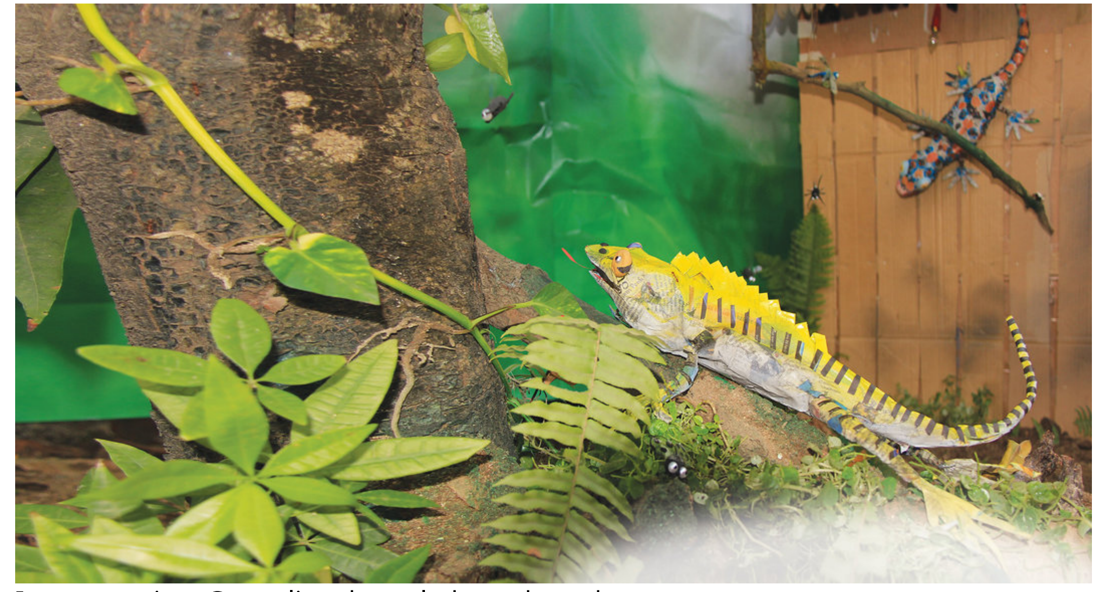
It was evening. Green lizard crawled on a branch. Suddenly, she noticed a gecko stuck to the wall of a house. Oh! A new friend, she thought.