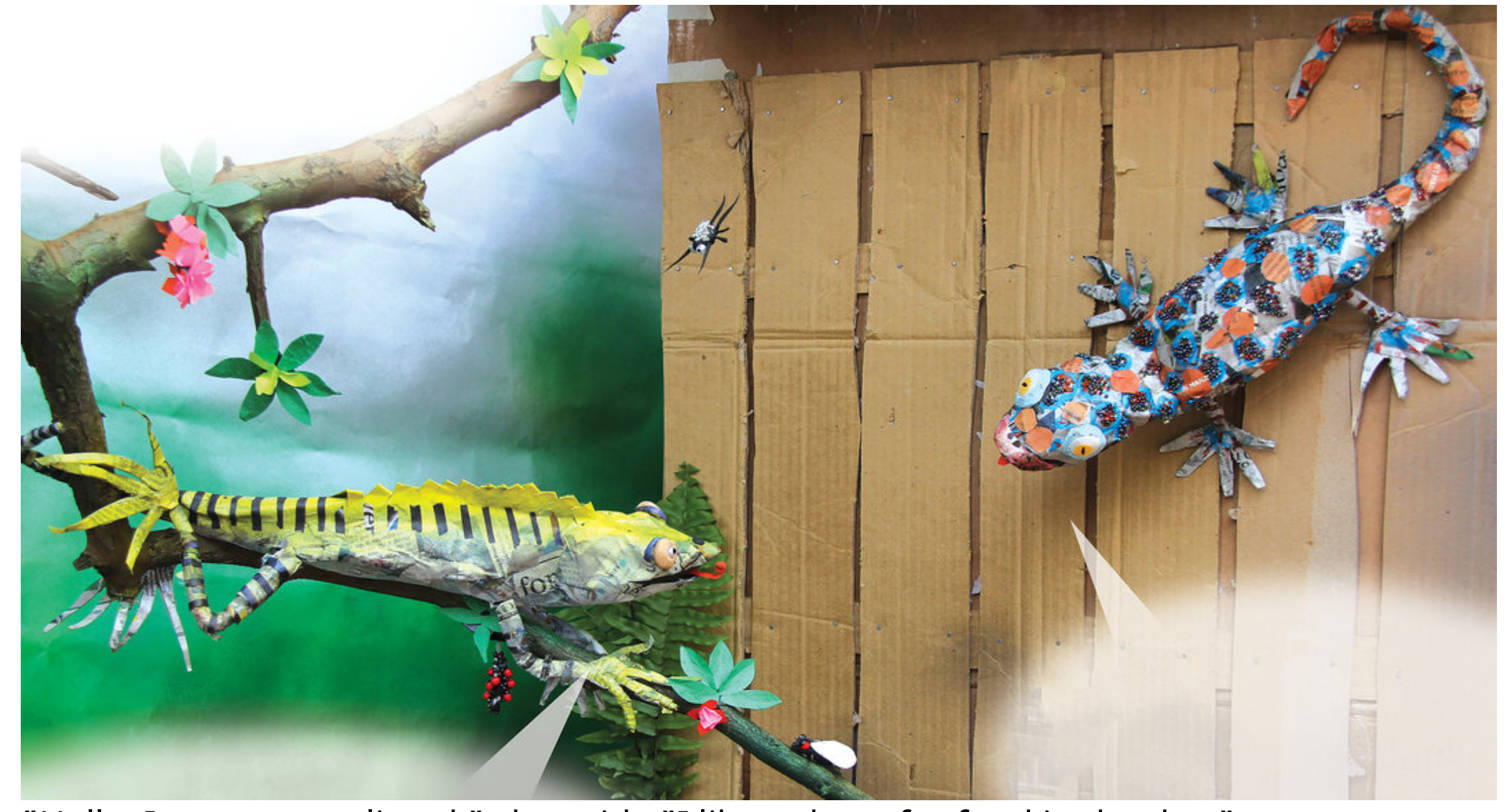
"Hello, I am a green lizard," she said. "I like to hunt for food in the day." "Hello, I am a gecko," he said. "I like to hunt for food at night." The two reptiles were very interested in one another's lives.