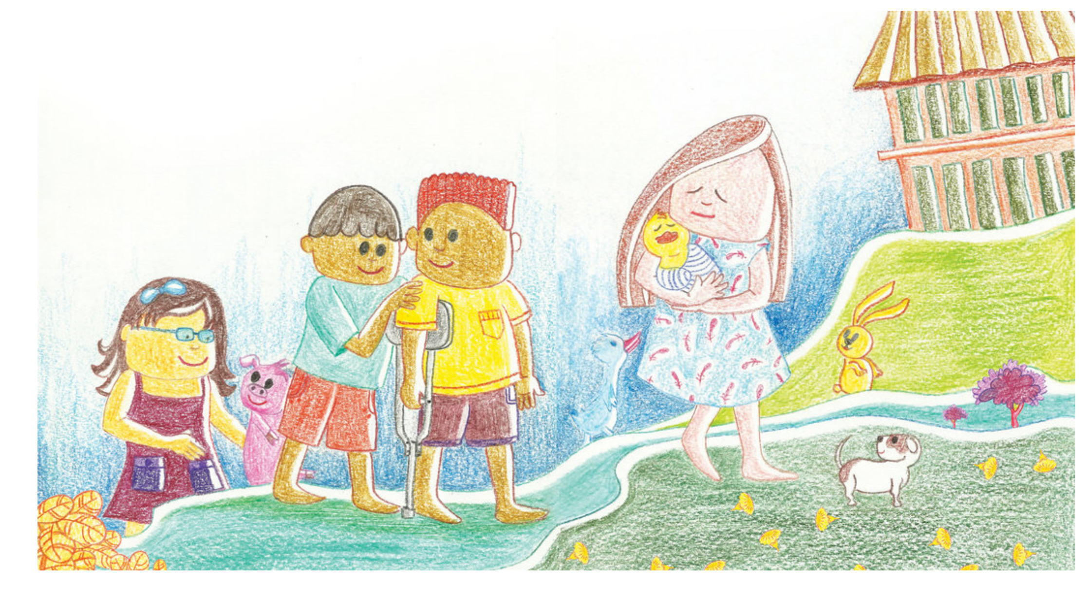
Poor Pichchu needed to go see a doctor. Nichchumani carried her all the way there.