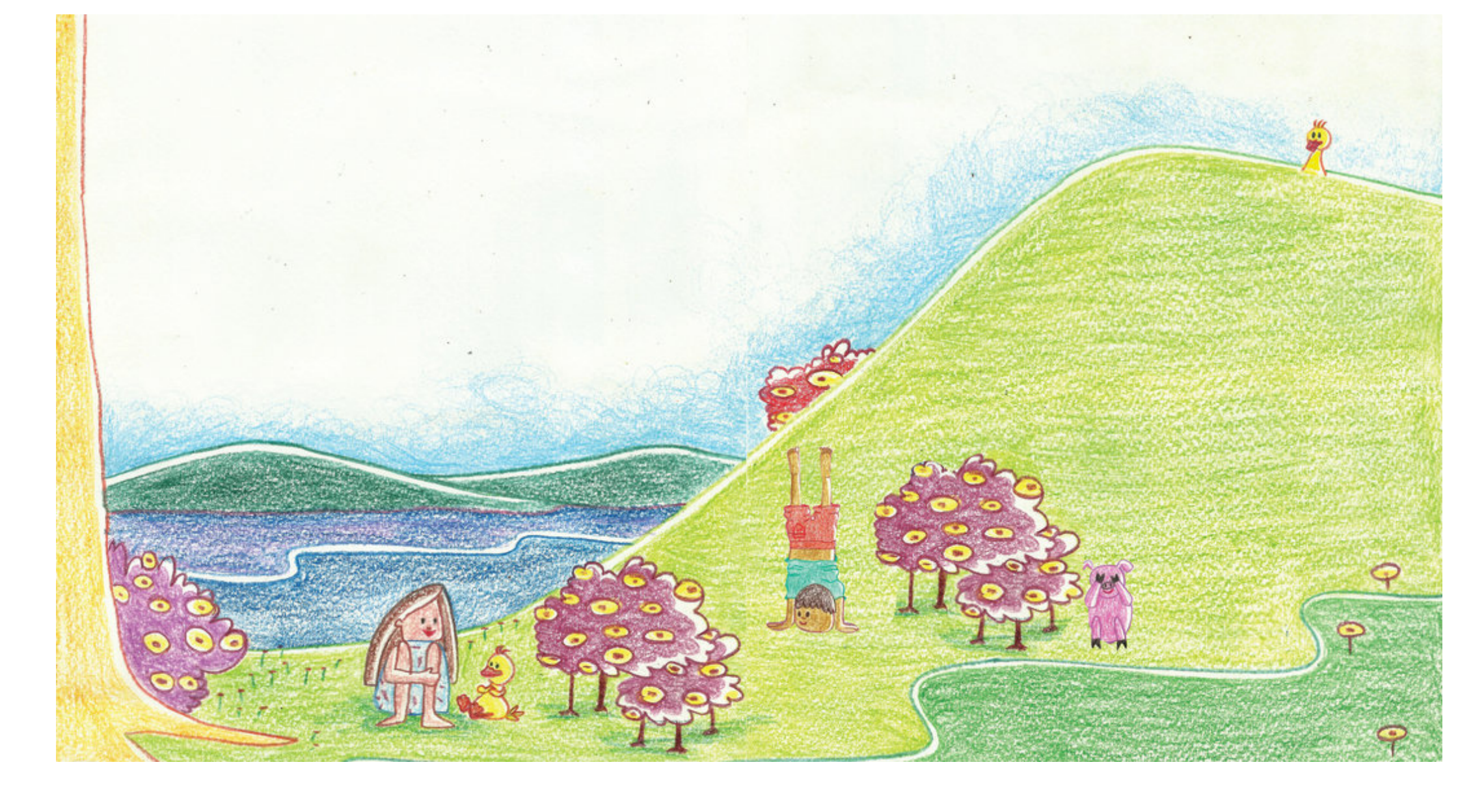
The doctor helped Pichchu and soon she was all better!