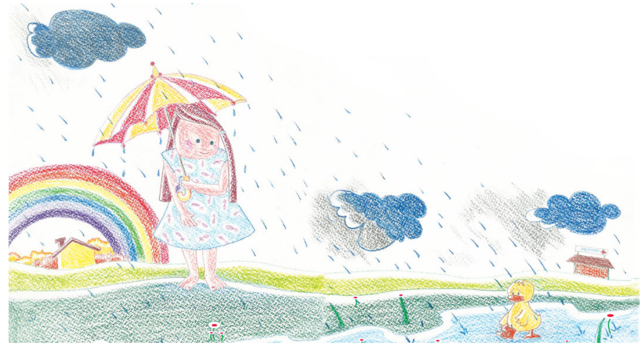
One day, Nichchumani went out for a walk and saw a lost duckling crying. "Why are you crying?" she asked.