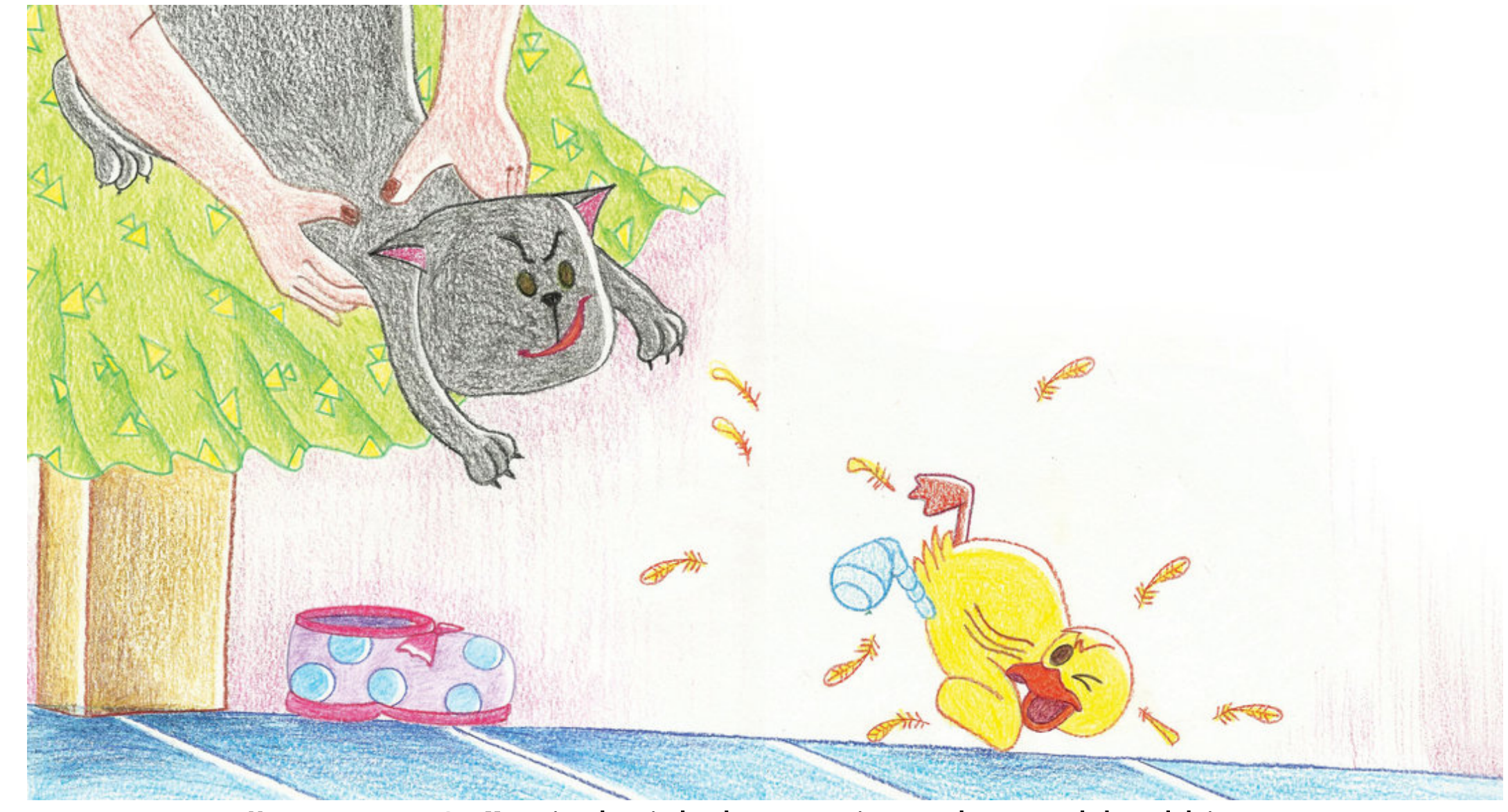
"KITTY, NO!" cried Nichchumani, as she grabbed kitty.