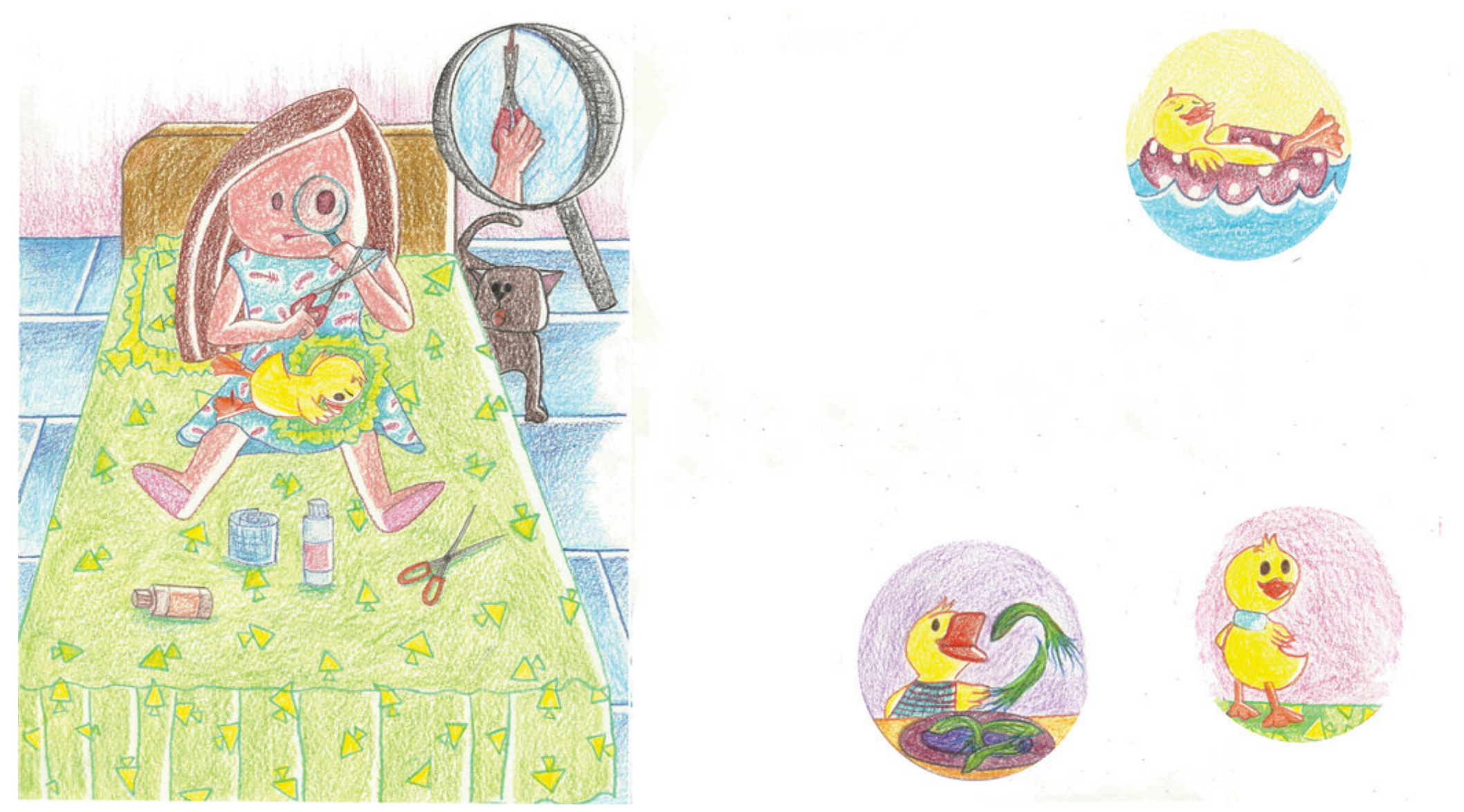
Poor Pichchu the duckling was hurt. She couldn't swim or play or do any of her favorite things.

"Don't worry," said Nichchumani. "We will get you all fixed up!"