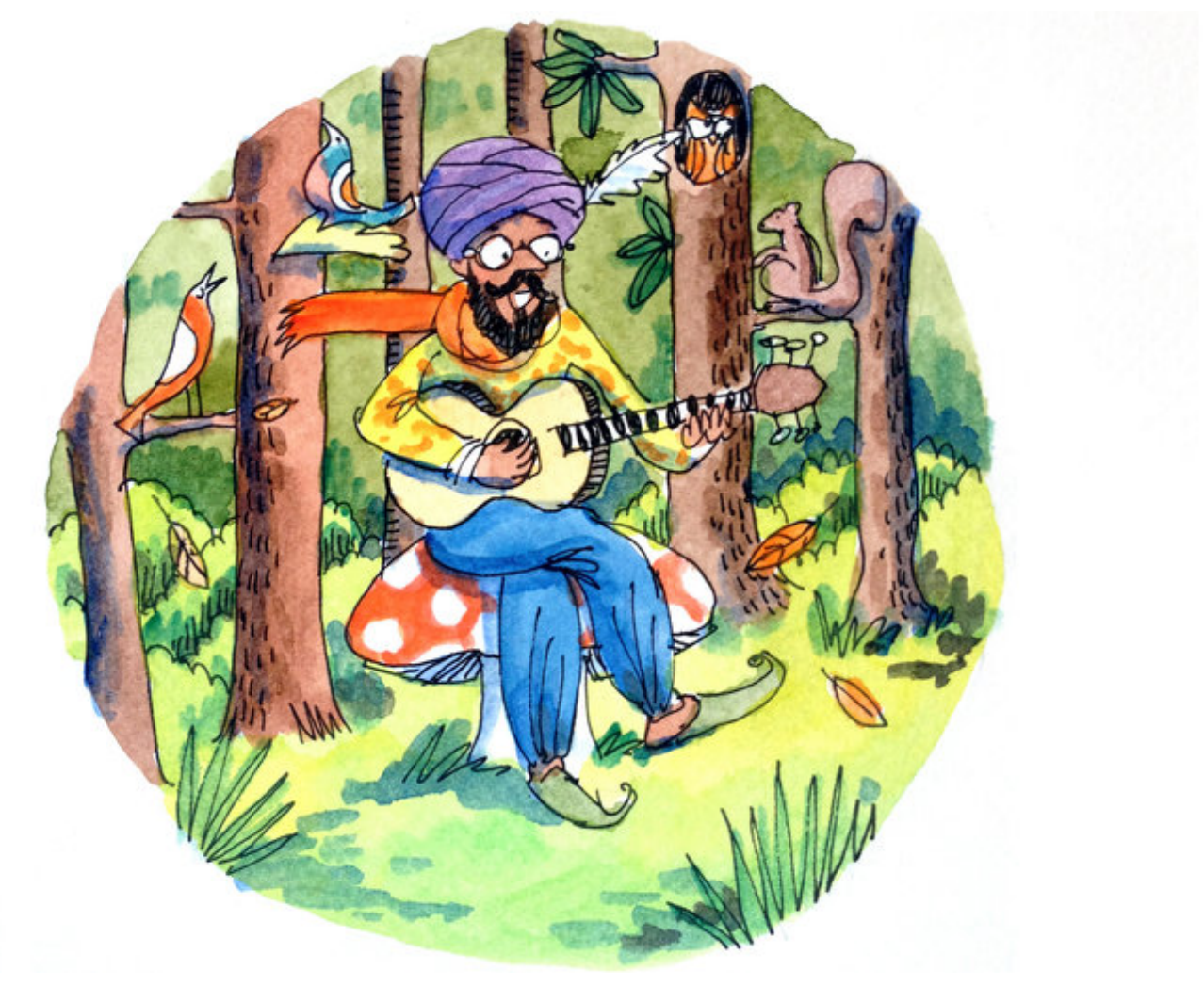
"Don't you seeeeeee?" sang the Tweety Birds and the Hooty Owls.

"If Singing Sardarjis don't, and Journalist Bears won't, the world would be a bad playyyyy-ce, don't you see?" sang Sardarji.