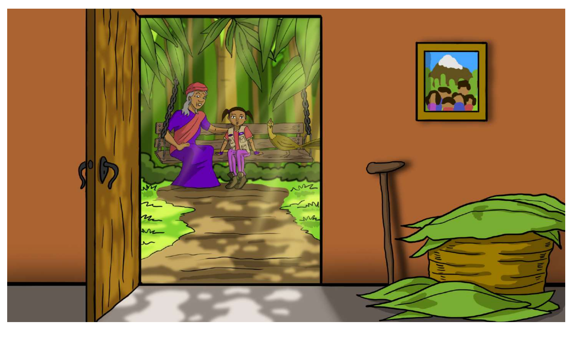
Just then, I see the tub with the magic leaves on top. It is next to Grandma's cane.