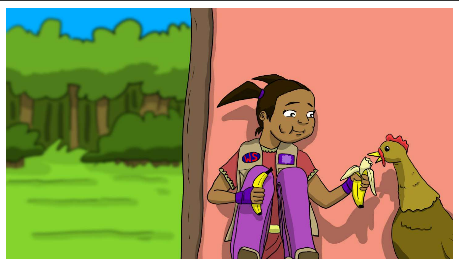
Then, I find a place to hide in the garden. After that, I eat the bananas.

I give some to my hen. They taste so sweet, and we eat all of the bananas in the bunch.