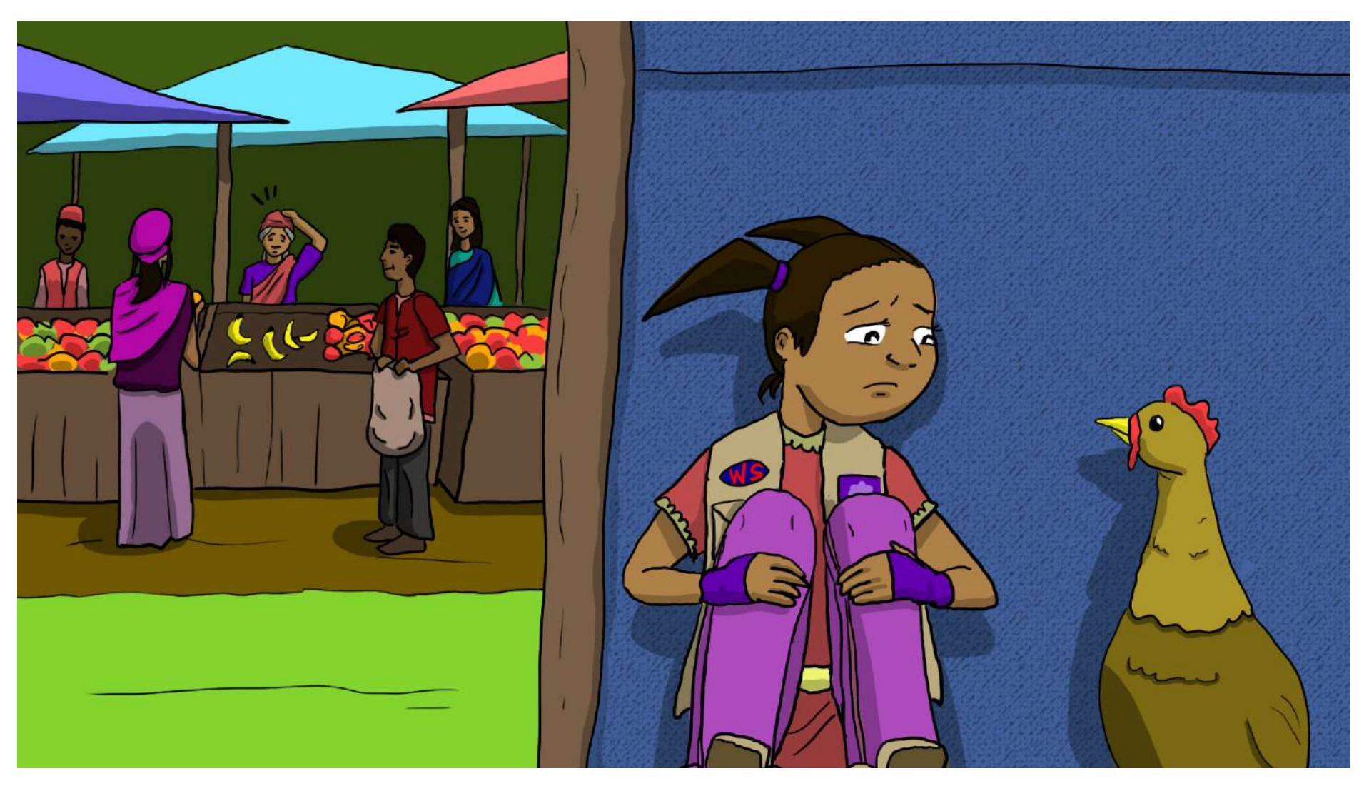
After that I go with Grandma to the market.

But Grandma does not have many bananas to sell at the market.