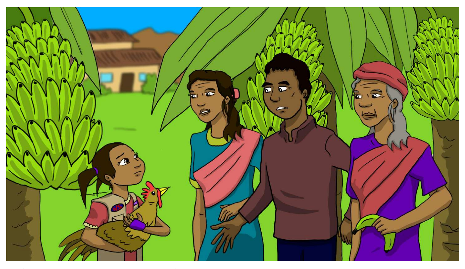
After the market, my mother, father and Grandma call me.

I tell them I will not take what is not mine to take.