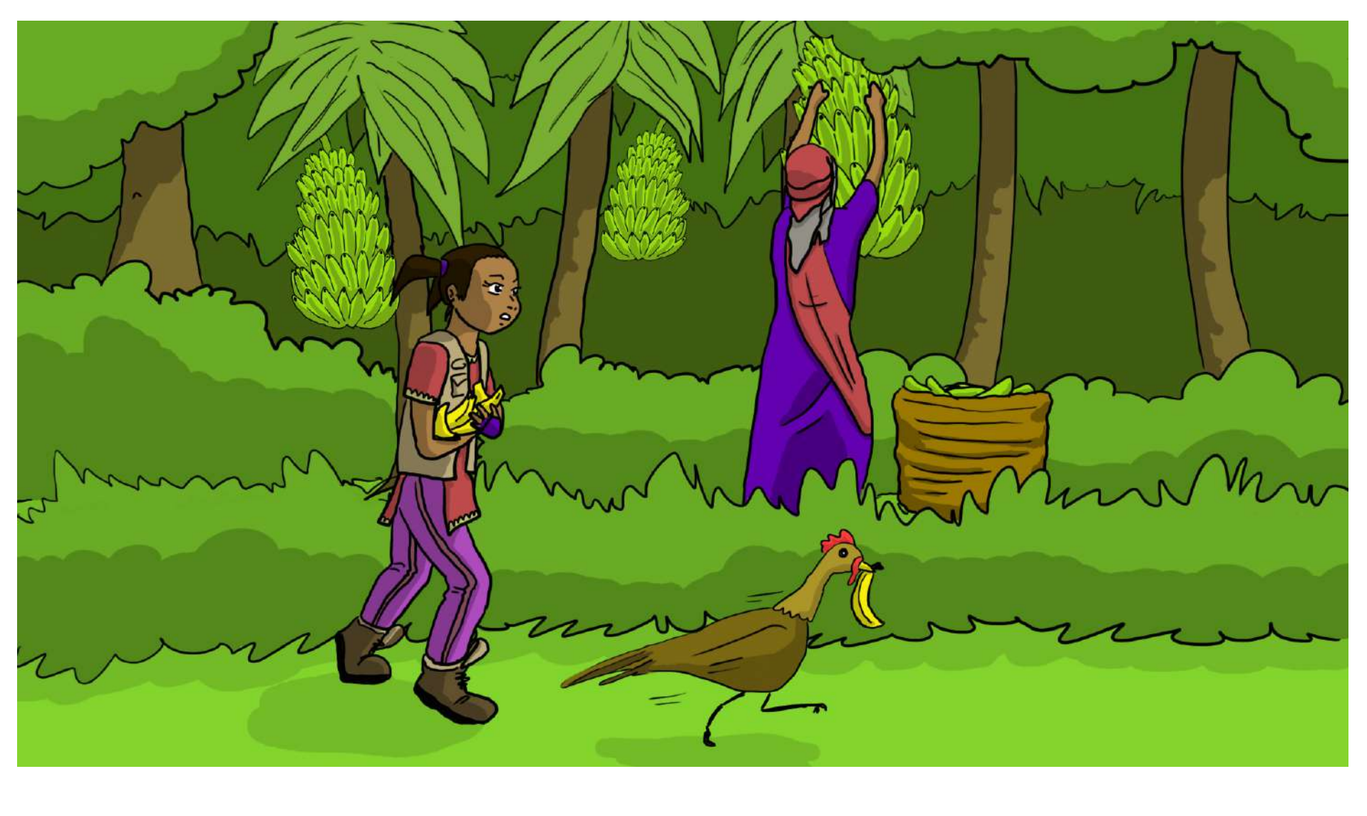
First, I take a bunch of bananas and put them under my top.

Next, I sneak past Grandma working in her garden so she can't see me.