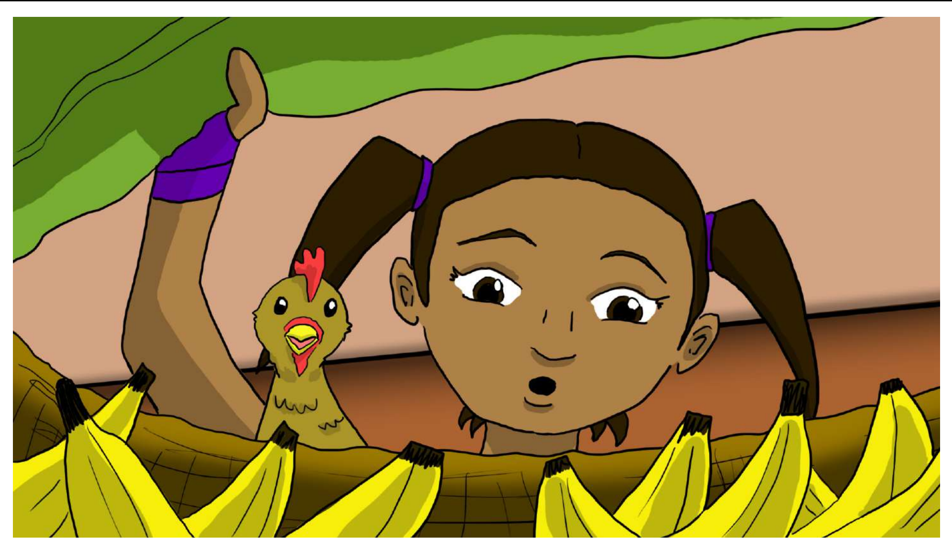
So I peek under the leaves and there are the sweet yellow ripe bananas.

The bananas smell so sweet that I have to taste them.