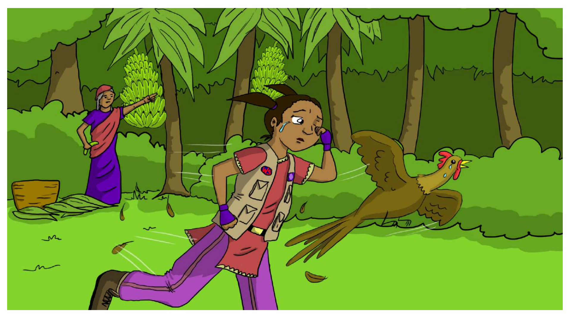
So I ask Grandma, "How does the magic work?"

Grandma says, "Don't be silly! You ask about too many things. Just go home and get me my pot."