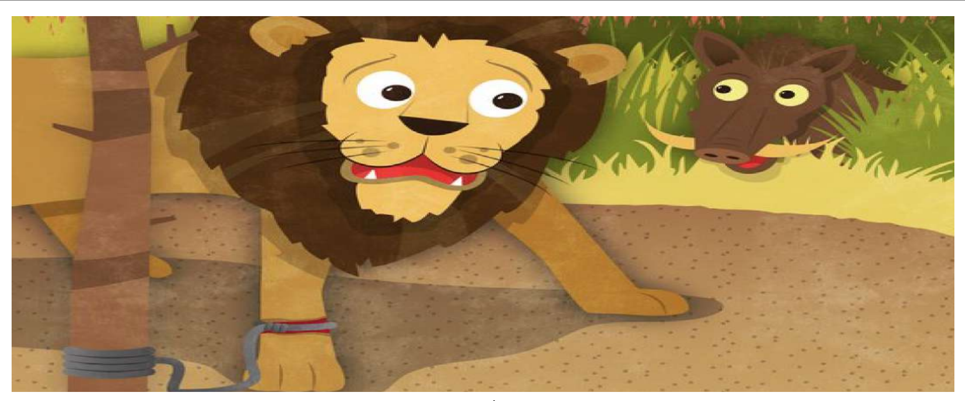
"Warthog! How could you betray me? Aren't we friends?" whined Lion.

"I thought we were friends, but you have shown your true colors," Warthog replied.