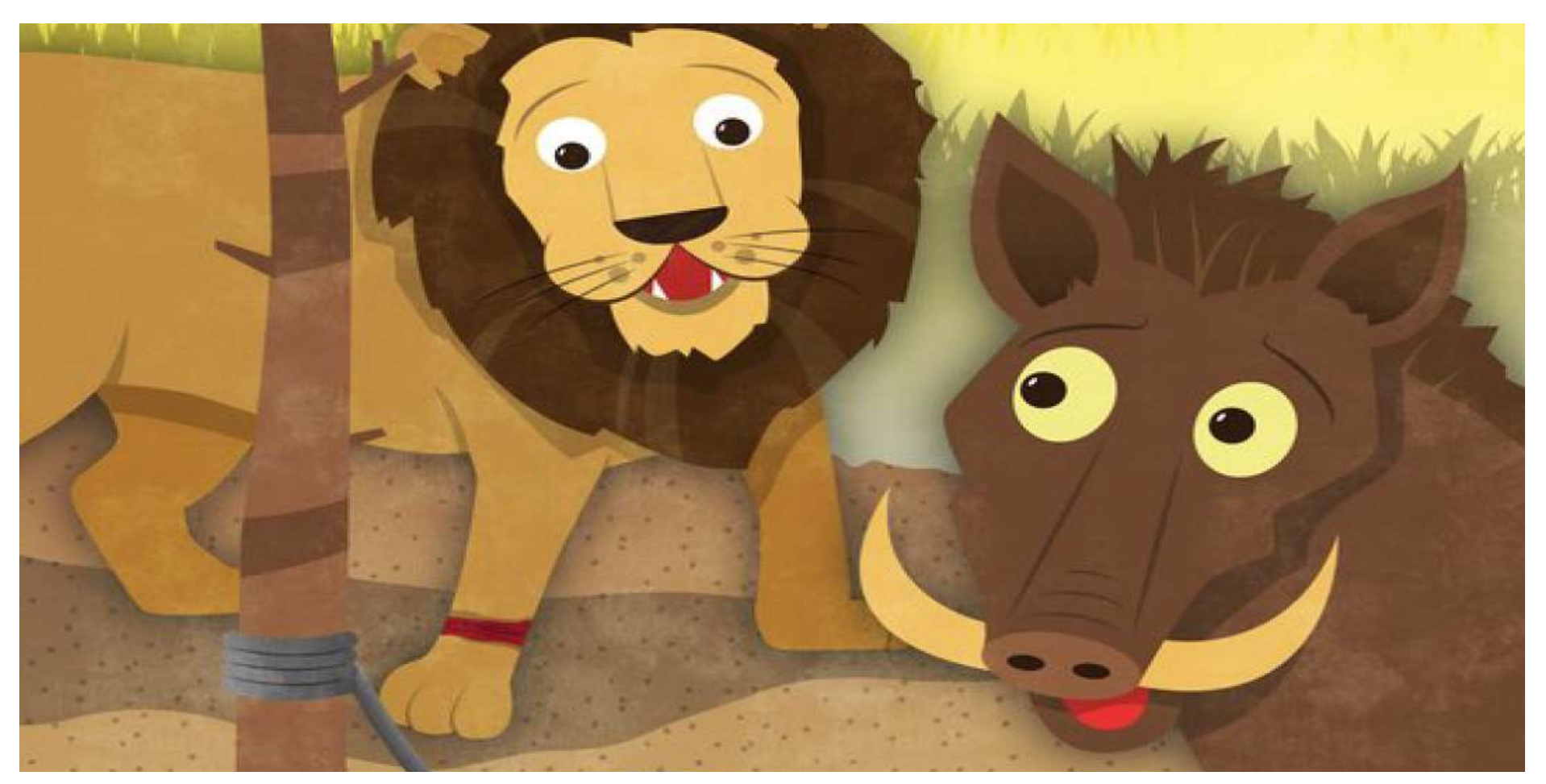
"Thank you for saving my life!" exclaimed Lion.

"I must go back to my herd now, good bye," said Warthog.