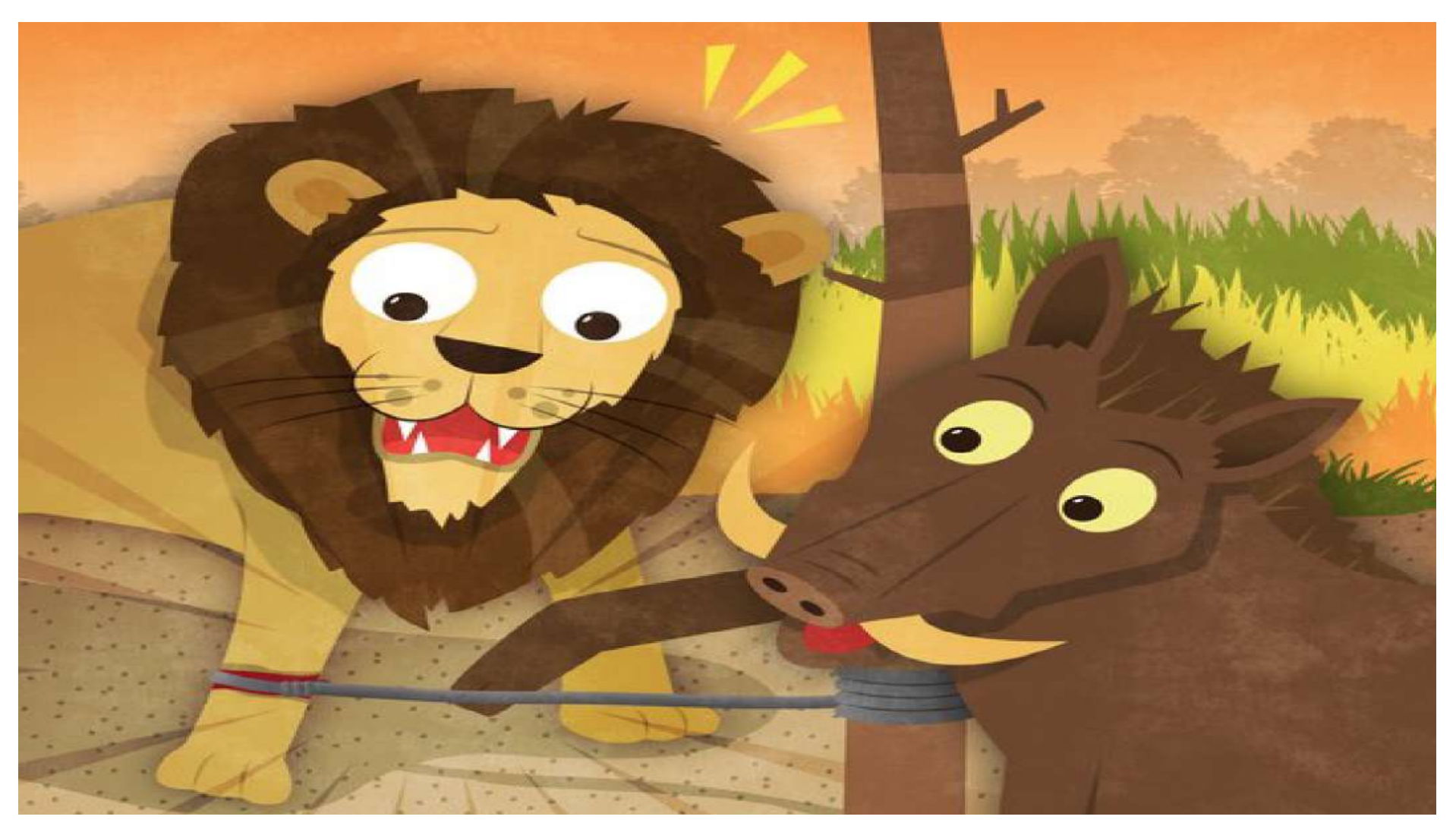
"Ouch!" Lion roared. Warthog had closed the trap on Lion's foot.

"Aha! I got you," boasted Warthog. "You should not have deceived me. Poor Lion, you will stay in that trap hungry and thirsty again. See if your huge teeth and sharp claws can help you now!"